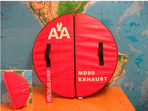
PW JT8D Off-Link Protective Long-term Storage "Rain Cap" Engine Cover