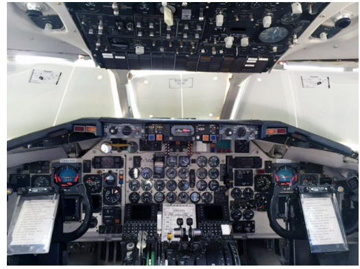
McDonnell Douglas MD80 Cockpit Heatshield Set