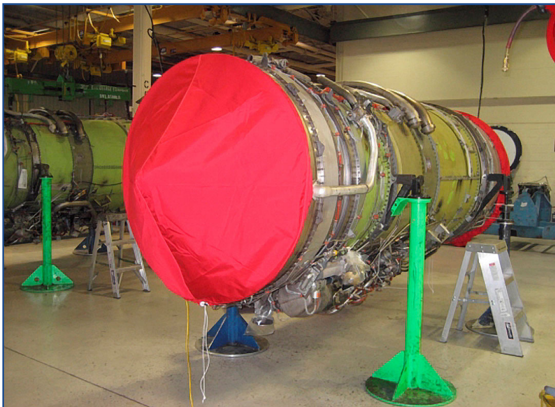
PW JT8D Off-Link Engine Shower Cap Cover Set