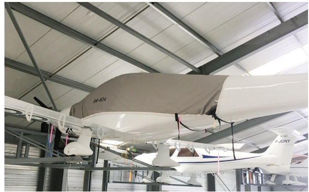
Dynaero MCR.4 Pickup Canopy Cover