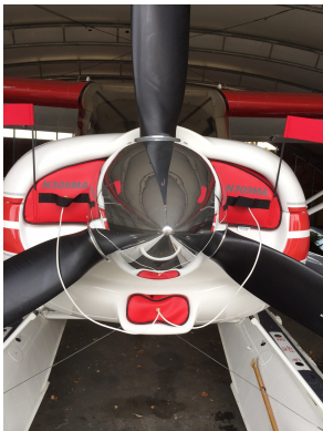
Maule Engine Inlet Plugs