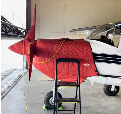
Maule Insulated Engine & Prop Covers

This cover type is made from Silver Acrylic Sunbrella canvas and is 100% lined with a soft and smooth microfiber. Bruce's Custom Covers developed this material combination especially for aircraft protection. The outer material is medium weight and treated for water resistance, UV resistance and anti-static buildup. The inner lining is a very soft and smooth microfiber to prevent scratching. The material is very reflective, and tests show that the cabin interior temperature can be reduced to near-ambient temperature on the hottest of days. It is water, ice and snow repellent, yet breathable to allow moisture to escape from between the cover and the aircraft surface.