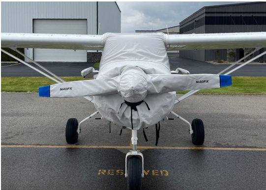
Maule MX7-180 Prop, Engine, Extended Canopy & Empennage Covers