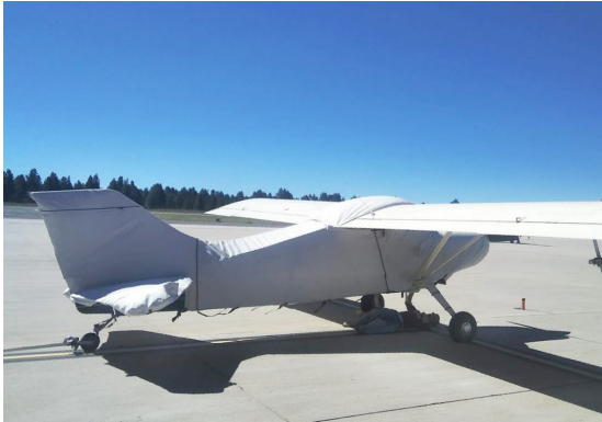
Maule M7-180 Full Body Over-Top Fuselage/Tail Cover