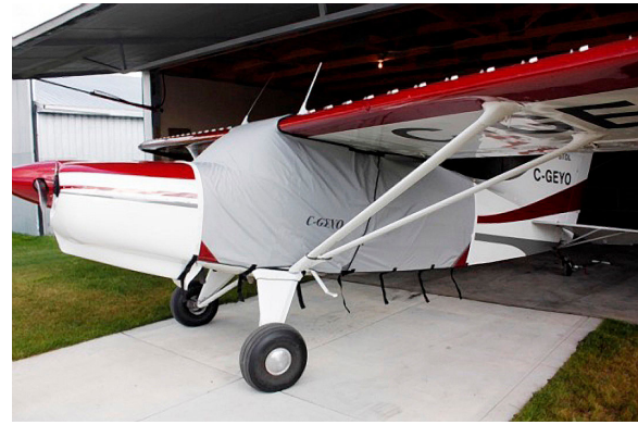
Maule Over-Top Extended Canopy Cover