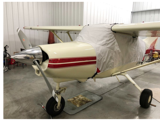
Maule MX-7-180 Wrap Around Canopy Cover