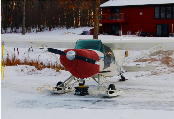
Maule Insulated Engine Cover

This cover type is made from Silver Acrylic Sunbrella canvas and is 100% lined with a soft and smooth microfiber. Bruce's Custom Covers developed this material combination especially for aircraft protection. The outer material is medium weight and treated for water resistance, UV resistance and anti-static buildup. The inner lining is a very soft and smooth microfiber to prevent scratching. The material is very reflective, and tests show that the cabin interior temperature can be reduced to near-ambient temperature on the hottest of days. It is water, ice and snow repellent, yet breathable to allow moisture to escape from between the cover and the aircraft surface.