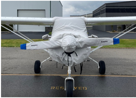
Maule MX7-180 Prop, Engine, Extended Canopy & Empennage Covers