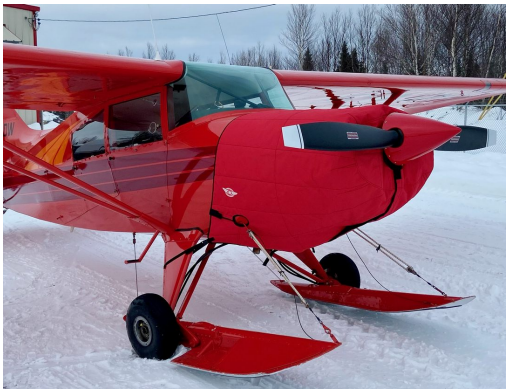
Maule M5 Insulated Engine Cover

This cover type is made from Silver Acrylic Sunbrella canvas and is 100% lined with a soft and smooth microfiber. Bruce's Custom Covers developed this material combination especially for aircraft protection. The outer material is medium weight and treated for water resistance, UV resistance and anti-static buildup. The inner lining is a very soft and smooth microfiber to prevent scratching. The material is very reflective, and tests show that the cabin interior temperature can be reduced to near-ambient temperature on the hottest of days. It is water, ice and snow repellent, yet breathable to allow moisture to escape from between the cover and the aircraft surface.