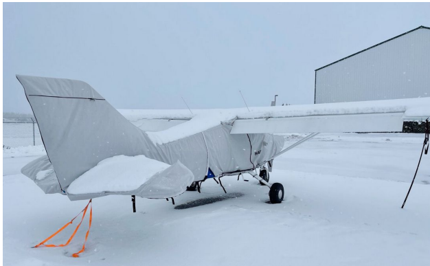
Maule MX7-180 Extended Canopy Cover, Engine, Prop & Empennage Covers.

WINTER USE MATERIAL - Made with Solution-Dyed Polyester fabric, this option is intended for seasonal use to aid in deicing, rain mitigation, or for occasional travel. The material is lighter and more compact, but more susceptible to UV damage and may have a shorter useful life if used continuously outside than the all-year use material.