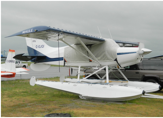
Maule Over-The-Top Canopy Cover