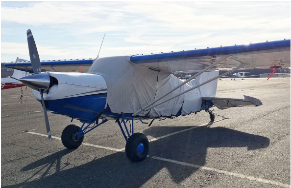
Maule M-5-235C Extended Canopy Cover, Empennage Cover