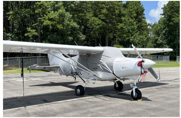
Maule MXT-7-180 Canopy & Empennage Covers, travel weight Maule MXT-7-180 Canopy & Empennage Covers, travel weight