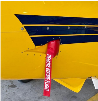
Maule MX-7-180C NACA vent plugs

block of sculpted urethane foam. Each plug has a zipper that allows the foam to be removed and dried if necessary. Engine plugs have warning flags that are visible from the cockpit or 'remove before flight' streamers sewn onto the face of the plugs. Most plugs are imprinted with the aircraft registration number in black for an extra charge. Storage bag NOT included. Engine plugs may be inserted after flight when the engine is still warm. Engine Inlet Plugs are commonly referred to as Cowl Plugs, Intake Plugs, Cowl Blocks, Engine Blocks, and Engine Bungs.