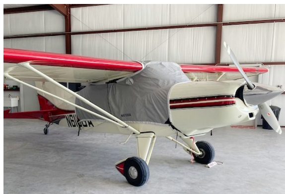
Maule M5-180C Travel Weight Canopy Cover