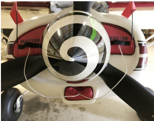
Maule M7-235 Engine Plugs

have warning flags that are visible from the cockpit or 'remove before flight' streamers sewn onto the face of the plugs. Most plugs are imprinted with the aircraft registration number in black for an extra charge. Storage bag NOT included. Engine plugs may be inserted after flight when the engine is still warm. Engine Inlet Plugs are commonly referred to as Cowl Plugs, Intake Plugs, Cowl Blocks, Engine Blocks, and Engine Bungs.