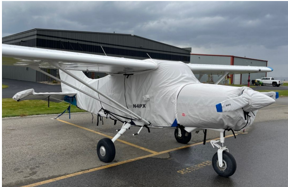
Maule MX7-180 Prop, Engine, Extended Canopy & Empennage Covers

WINTER USE MATERIAL - Made with Solution-Dyed Polyester fabric, this option is intended for seasonal use to aid in deicing, rain mitigation, or for occasional travel. The material is lighter and more compact, but more susceptible to UV damage and may have a shorter useful life if used continuously outside than the all-year use material.