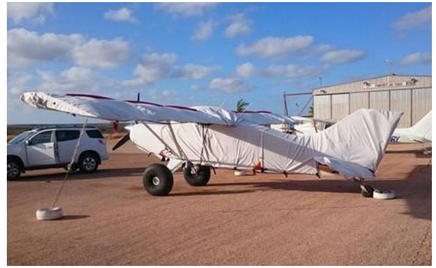
Maule M7-235 Extended Canopy, Wing, Engine & Empennage Covers