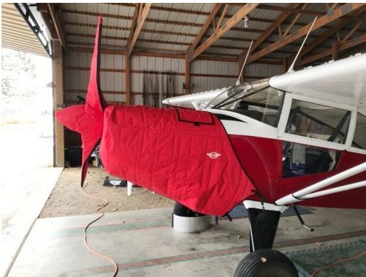
Maule M4-220C Insulated Engine & Prop Covers