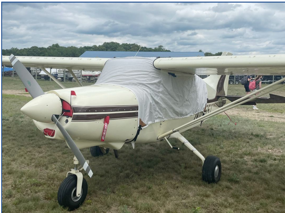
Maule MXT-7-180A Canopy Cover, Engine Plugs