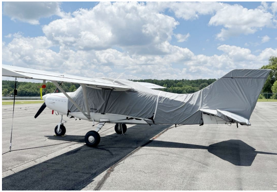
Maule MXT-7-180 Canopy & Empennage Covers, travel weight