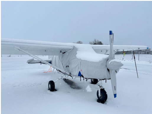
Maule MX7-180 Extended Canopy Cover, Engine, Prop & Empennage Covers.

WINTER USE MATERIAL - Made with Solution-Dyed Polyester fabric, this option is intended for seasonal use to aid in deicing, rain mitigation, or for occasional travel. The material is lighter and more compact, but more susceptible to UV damage and may have a shorter useful life if used continuously outside than the all-year use material.