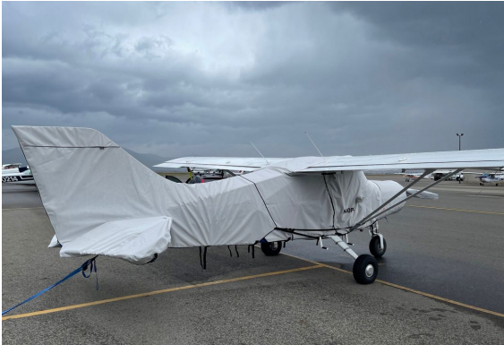
Maule MX7-180 Prop, Engine, Extended Canopy & Empennage Covers