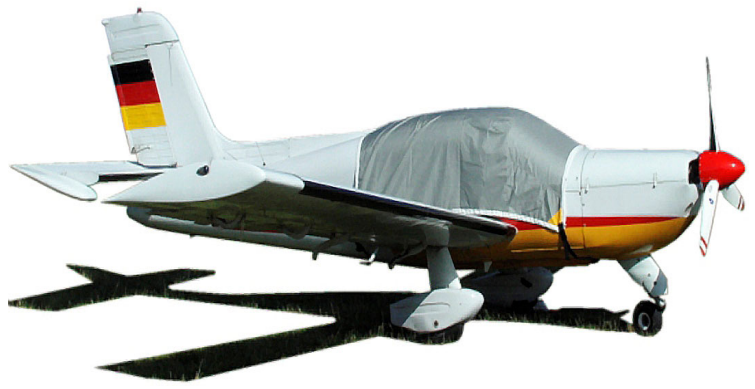
Rallye 150 Canopy Cover