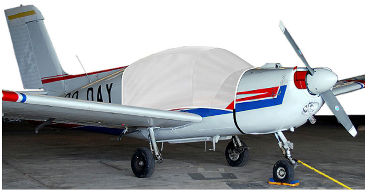
Standard Canopy Cover for MS893A