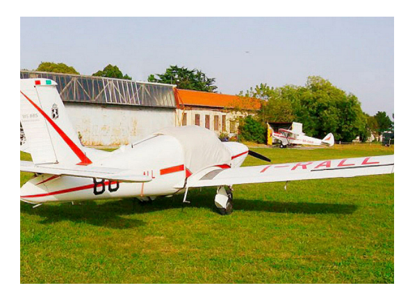
Standard Canopy Cover for MS893A