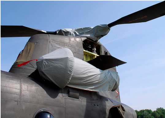
Boeing Vertol CH-47 Engine and Rotor Hub Covers

Insulated Covers Material - A special composite material of solution-dyed polyester, 3M Thinsulate insulation, and soft nylon interior fabric. Our insulated covers are designed to complement an engine preheater and help retain heat in the engine compartment after shutdown. If you operate your aircraft in cold-weather, these covers will help prevent engine wear and tear.