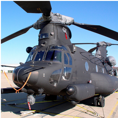
Boeing Vertol MH-47 Rotor Hubs, Engine & Other Covers