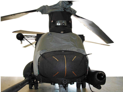
Boeing Vertol CH-47 Forward Cabin & Rotor Hub Cover

Insulated Covers Material - A special composite material of solution-dyed polyester, 3M Thinsulate insulation, and soft nylon interior fabric. Our insulated covers are designed to complement an engine preheater and help retain heat in the engine compartment after shutdown. If you operate your aircraft in cold-weather, these covers will help prevent engine wear and tear.