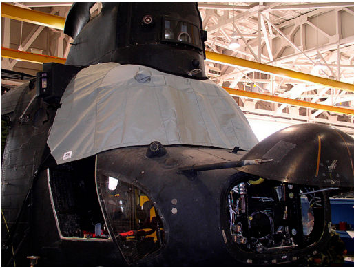
Boeing Vertol CH-47 Windshield/Cockpit Cover