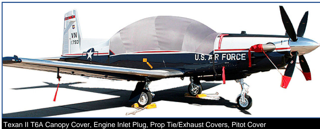
Texan II T6A Canopy Cover, Engine Inlet Plug, Prop Tie/Exhaust Covers, Pitot Cover