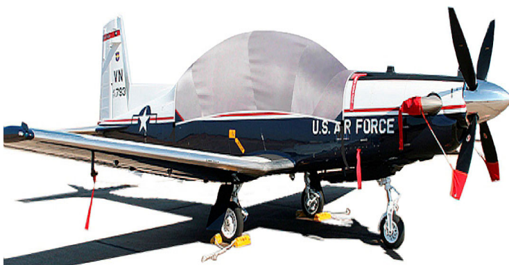
Texan II T6A Canopy Cover, Engine Inlet Plug, Prop Tie/Exhaust Covers, Pitot Cover