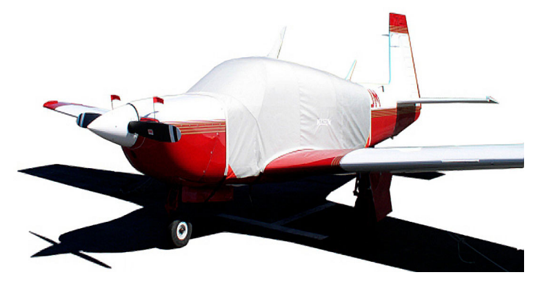
Mooney M20 Extended Canopy Cover & Engine Plugs