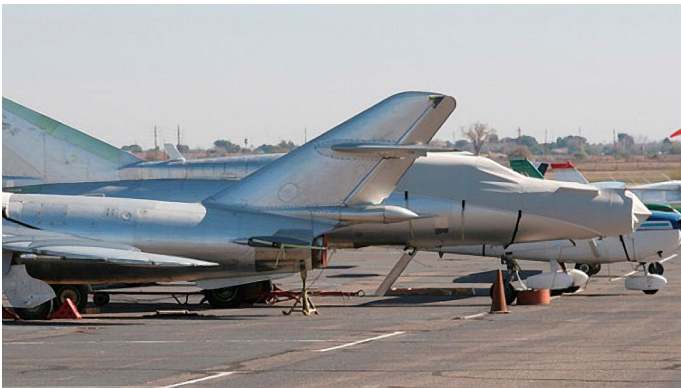
Mikoyan Mig 21 Canopy/Nose Cover

This cover type is made from Silver Acrylic Sunbrella canvas and is 100% lined with a soft and smooth microfiber. Bruce's Custom Covers developed this material combination especially for aircraft protection. The outer material is medium weight and treated for water resistance, UV resistance and anti-static buildup. The inner lining is a very soft and smooth microfiber to prevent scratching. The material is very reflective, and tests show that the cabin interior temperature can be reduced to near-ambient temperature on the hottest of days. It is water, ice and snow repellent, yet breathable to allow moisture to escape from between the cover and the aircraft surface.