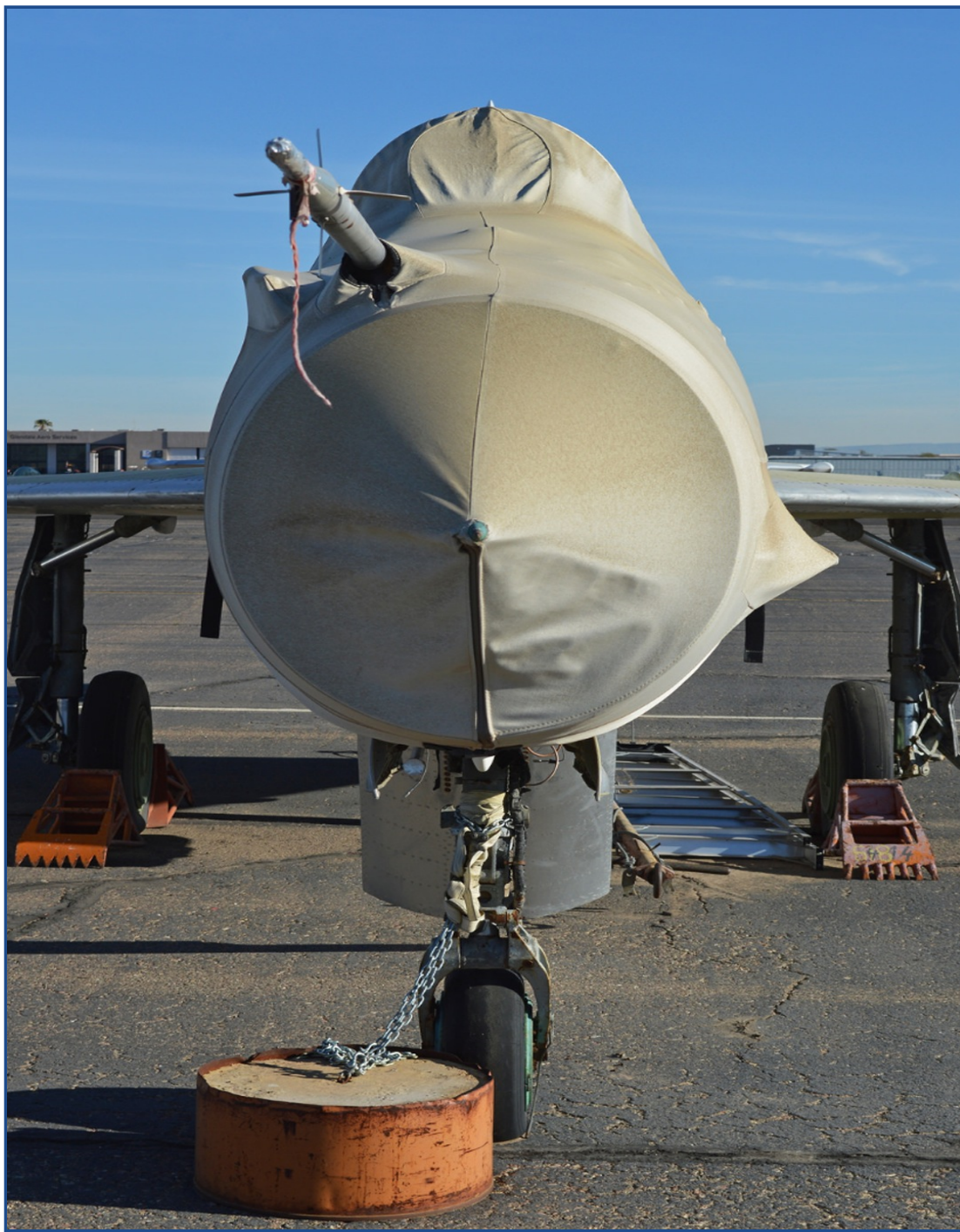
Mig 21 Canopy/Nose Cover