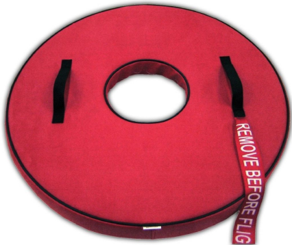
Mig 21 Intake Plug

The Engine Inlet Plugs are custom fit for your Mikoyan Mig 21 intakes, made with heavy-duty vinyl material, and stuffed with a single block of sculpted urethane foam. Each plug has a zipper that allows the foam to be removed and dried if necessary. Engine plugs have 'remove before flight' streamers sewn onto the face of the plugs. Most plugs are imprinted with the aircraft registration number in black for an extra charge. Storage bag NOT included. Engine plugs may be inserted after flight when the engine is still warm. Engine Inlet Plugs are commonly referred to as Cowl Plugs, Intake Plugs, Cowl Blocks, Engine Blocks, and Engine Bungs.