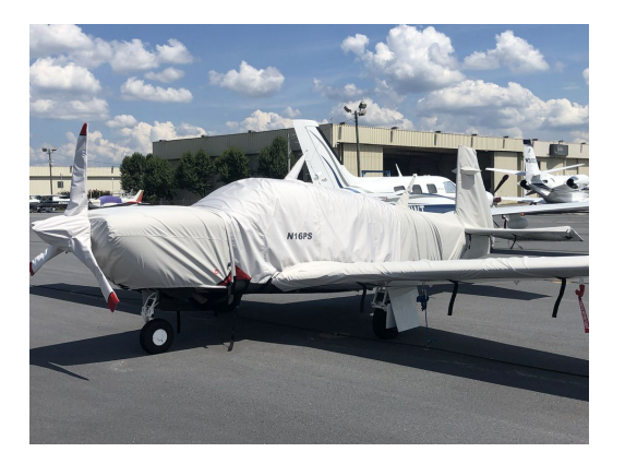
Mooney M20TN Acclaim Full Cover Set

This cover type is made from Silver Acrylic Sunbrella canvas and is 100% lined with a soft and smooth microfiber. Bruce's Custom Covers developed this material combination especially for aircraft protection. The outer material is medium weight and treated for water resistance, UV resistance and anti-static buildup. The inner lining is a very soft and smooth microfiber to prevent scratching. The material is very reflective, and tests show that the cabin interior temperature can be reduced to near-ambient temperature on the hottest of days. It is water, ice and snow repellent, yet breathable to allow moisture to escape from between the cover and the aircraft surface.