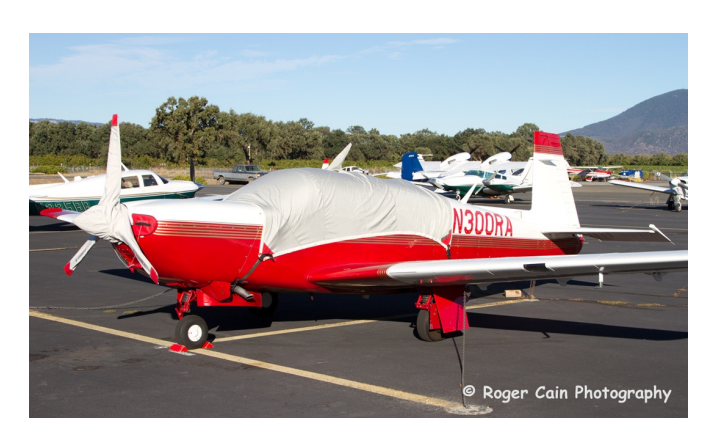
Mooney M20M Bravo Canopy Cover, 3-Blade Prop Cover