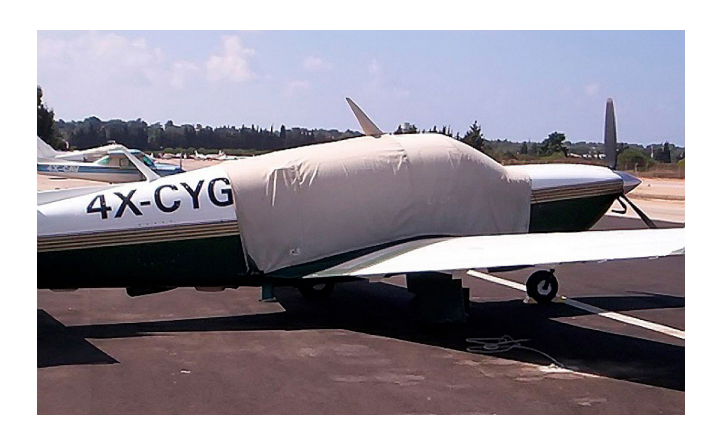
Mooney M20 Extended Canopy Cover

This cover type is made from Silver Acrylic Sunbrella canvas and is 100% lined with a soft and smooth microfiber. Bruce's Custom Covers developed this material combination especially for aircraft protection. The outer material is medium weight and treated for water resistance, UV resistance and anti-static buildup. The inner lining is a very soft and smooth microfiber to prevent scratching. The material is very reflective, and tests show that the cabin interior temperature can be reduced to near-ambient temperature on the hottest of days. It is water, ice and snow repellent, yet breathable to allow moisture to escape from between the cover and the aircraft surface.