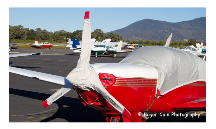
Mooney M20M Bravo 3-Blade Prop Cover, Engine Plugs

Engine Inlet Plugs are custom fit for your Mooney M20V Acclaim Ultra intakes, made with heavy-duty vinyl material, and stuffed with a single block of sculpted urethane foam. Each plug has a zipper that allows the foam to be removed and dried if necessary. Engine plugs have warning flags that are visible from the cockpit or 'remove before flight' streamers sewn onto the face of the plugs. Most plugs are imprinted with the aircraft registration number in black for an extra charge. Storage bag NOT included. Engine plugs may be inserted after flight when the engine is still warm. Engine Inlet Plugs are commonly referred to as Cowl Plugs, Intake Plugs, Cowl Blocks, Engine Blocks, and Engine Bungs.