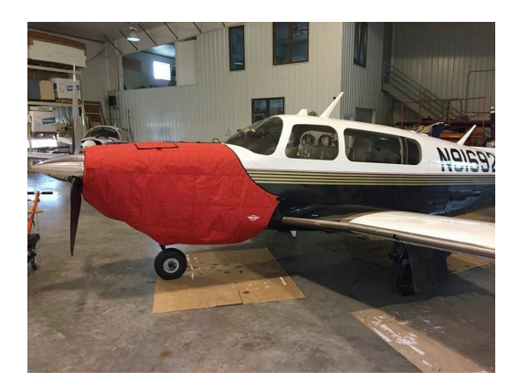
Mooney Ovation Insulated Engine Cover