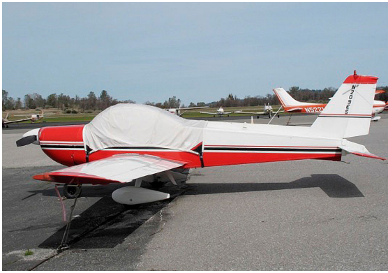
Messerschmitt BO-209 Monsoon Canopy Cover