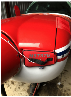
Mooney 201 Engine Inlet Plugs