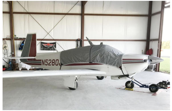
Mooney M20J Travel Canopy Cover