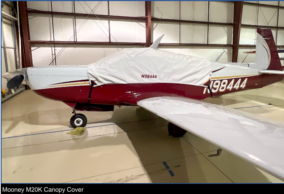
Mooney M20K Canopy Cover