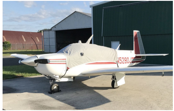
Mooney 201 M20J Travel Canopy Cover