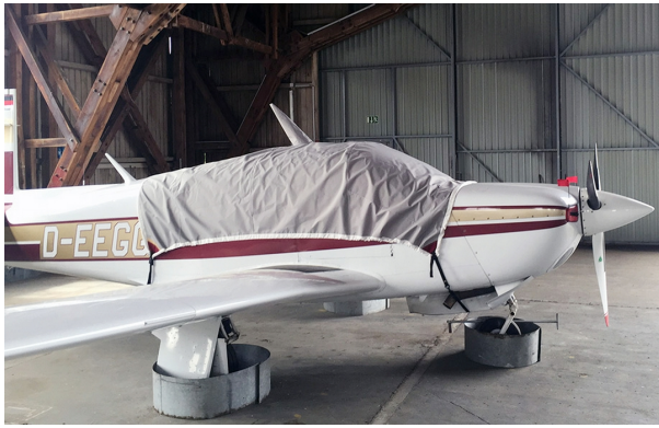
Mooney M20J/M20K Travel Cover