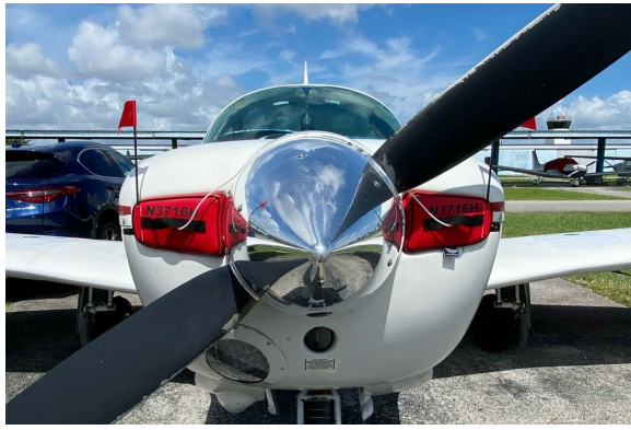
Mooney 201 M20J Engine Plugs