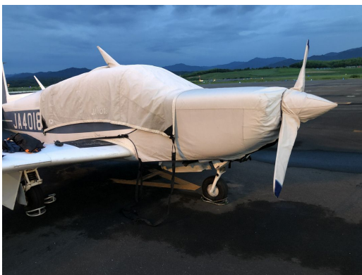
Mooney M20K Canopy, Engine & Prop Covers

This cover type is made from Silver Acrylic Sunbrella canvas and is 100% lined with a soft and smooth microfiber. Bruce's Custom Covers developed this material combination especially for aircraft protection. The outer material is medium weight and treated for water resistance, UV resistance and anti-static buildup. The inner lining is a very soft and smooth microfiber to prevent scratching. The material is very reflective, and tests show that the cabin interior temperature can be reduced to near-ambient temperature on the hottest of days. It is water, ice and snow repellent, yet breathable to allow moisture to escape from between the cover and the aircraft surface.