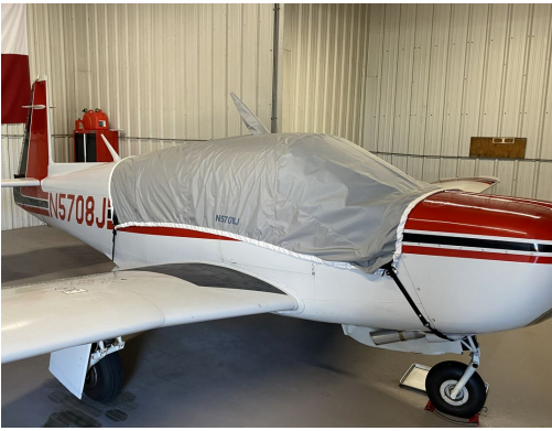
Mooney M20J Travel Cover, Light Weight Canopy Cover