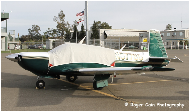
Mooney 201 Standard Canopy Cover

This cover type is made from Silver Acrylic Sunbrella canvas and is 100% lined with a soft and smooth microfiber. Bruce's Custom Covers developed this material combination especially for aircraft protection. The outer material is medium weight and treated for water resistance, UV resistance and anti-static buildup. The inner lining is a very soft and smooth microfiber to prevent scratching. The material is very reflective, and tests show that the cabin interior temperature can be reduced to near-ambient temperature on the hottest of days. It is water, ice and snow repellent, yet breathable to allow moisture to escape from between the cover and the aircraft surface.