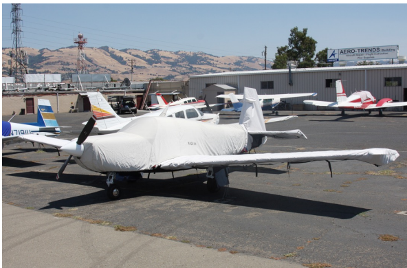
Mooney 231 Full Cover Set

WINTER USE MATERIAL - Made with Solution-Dyed Polyester fabric, this option is intended for seasonal use to aid in deicing, rain mitigation, or for occasional travel. The material is lighter and more compact, but more susceptible to UV damage and may have a shorter useful life if used continuously outside than the all-year use material.