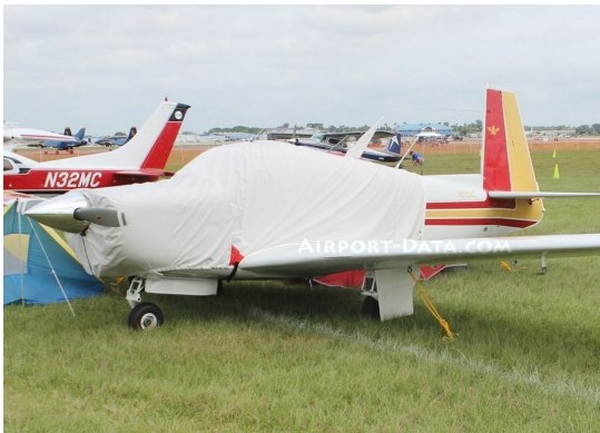
Mooney M20C Extended Canopy/Engine Cover