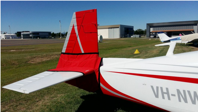
Mooney M20J Tailcone Cover

WINTER USE MATERIAL - Made with Solution-Dyed Polyester fabric, this option is intended for seasonal use to aid in deicing, rain mitigation, or for occasional travel. The material is lighter and more compact, but more susceptible to UV damage and may have a shorter useful life if used continuously outside than the all-year use material.