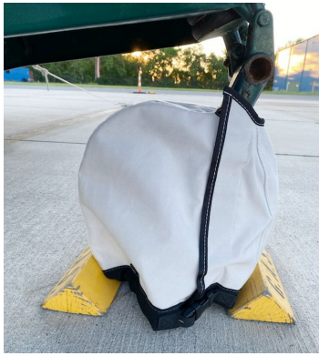
Mooney 201 Nose Wheel Cover