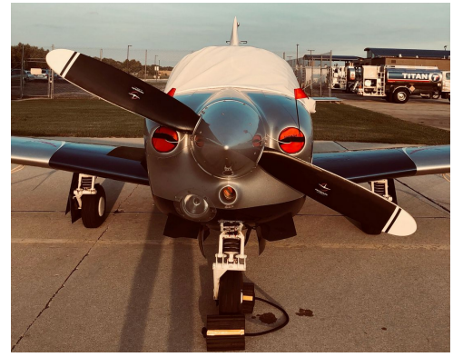
Mooney M20J Engine Plugs, Lopresti Type