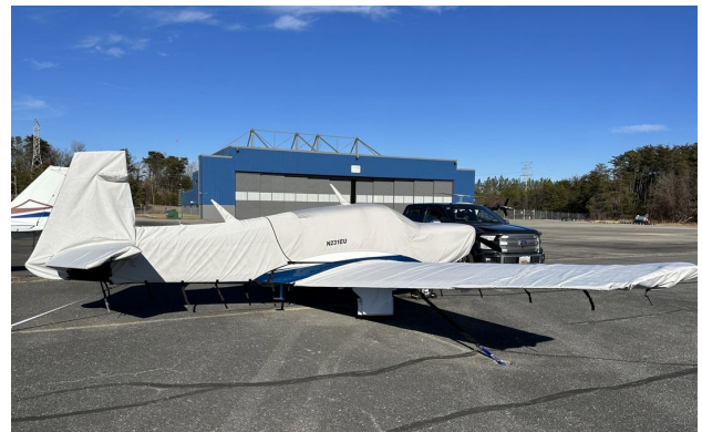
Mooney M20K 231 Cover Set