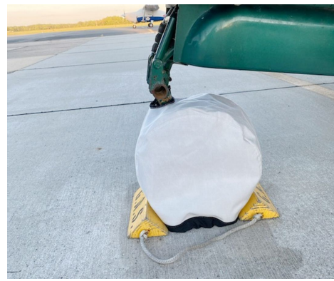
Mooney 201 Nose Wheel Cover