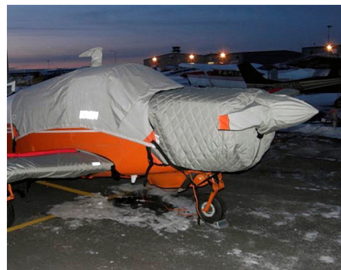
Mooney M20F Prop/Spinner, Insulated Engine, Wing and Canopy Covers