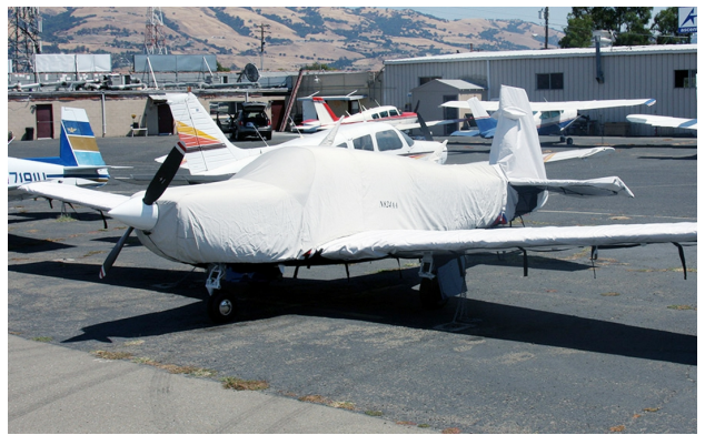
Mooney M20J/M20K Engine Cover