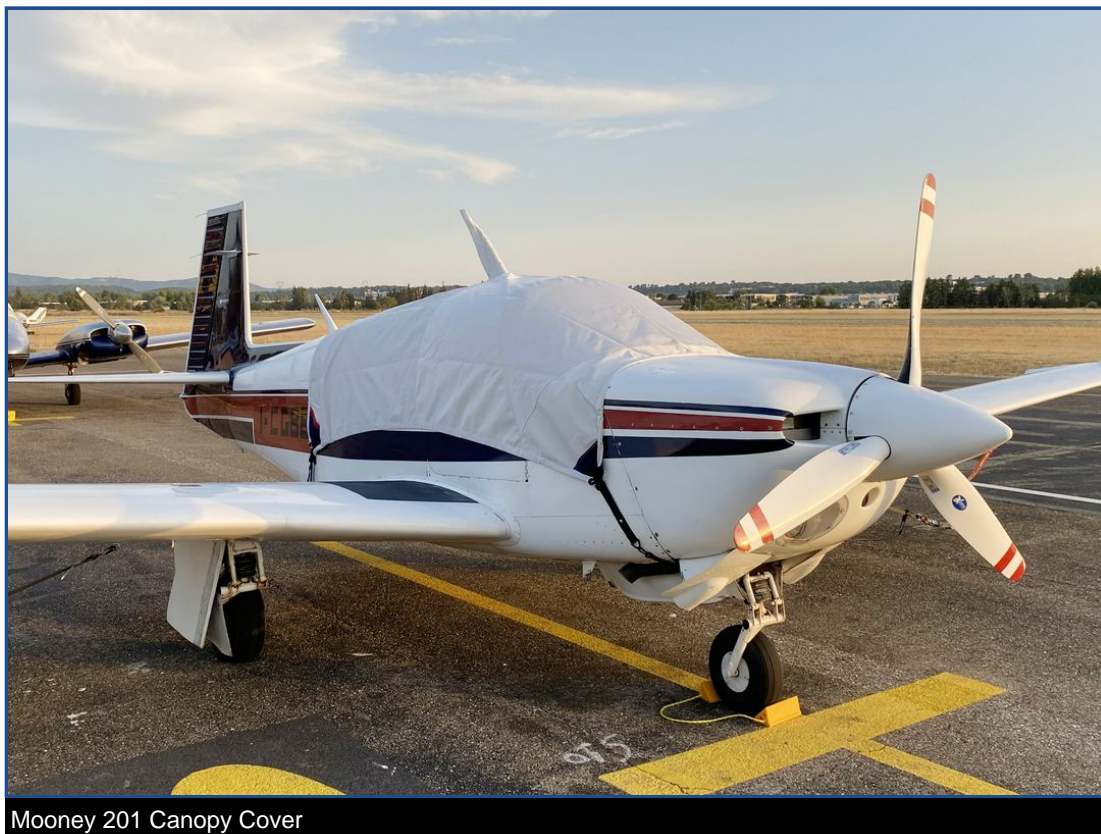
Mooney 201 Canopy Cover