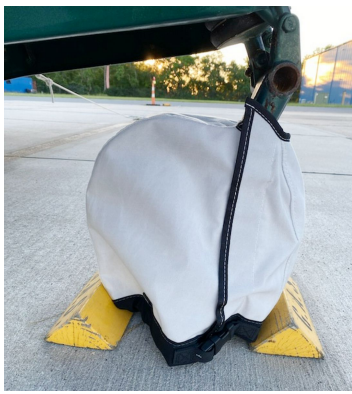
Mooney 201 Nose Wheel Cover