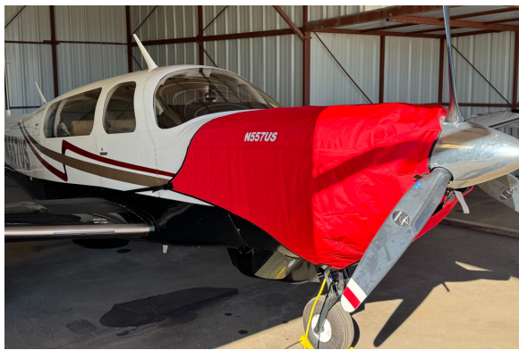
Mooney M20M, Insulated Engine Cover, doesn't cover gear well