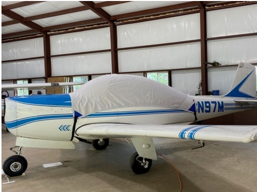
Meyers (Rockwell) 200 Canopy Cover