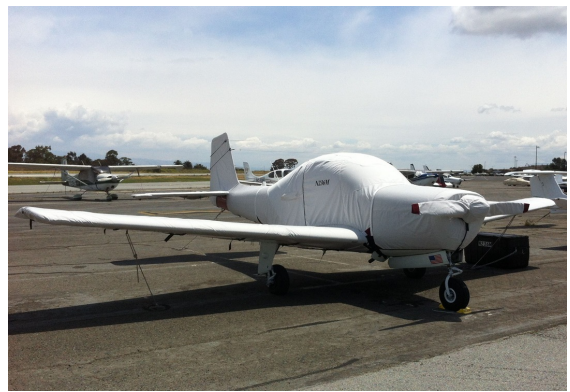
Meyers 200 Complete Cover Set