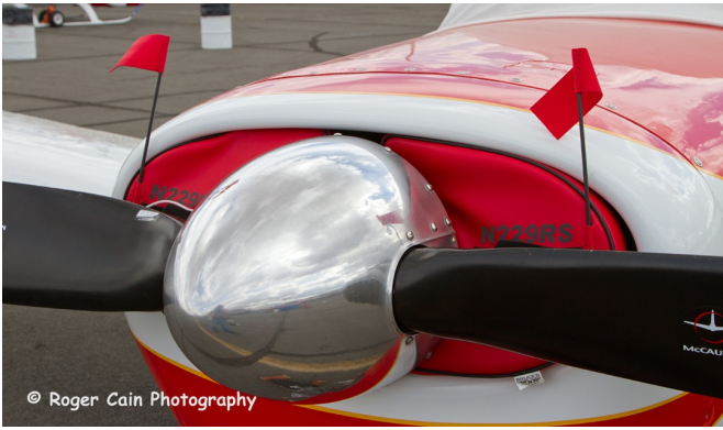
Meyer (Aero Commander) 200 Engine Plugs