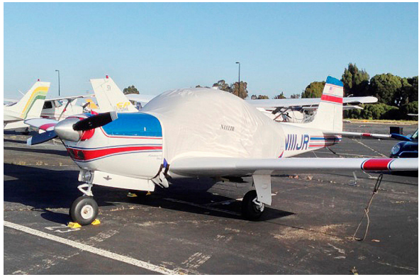
Meyers 200 Extended Canopy Cover & Engine Plugs