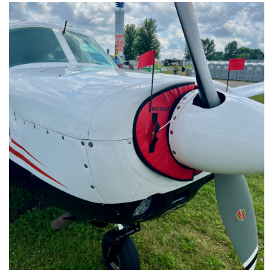
Mooney M20F Engine Plugs