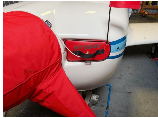
Mooney Engine Inlet Plug & Prop Cover