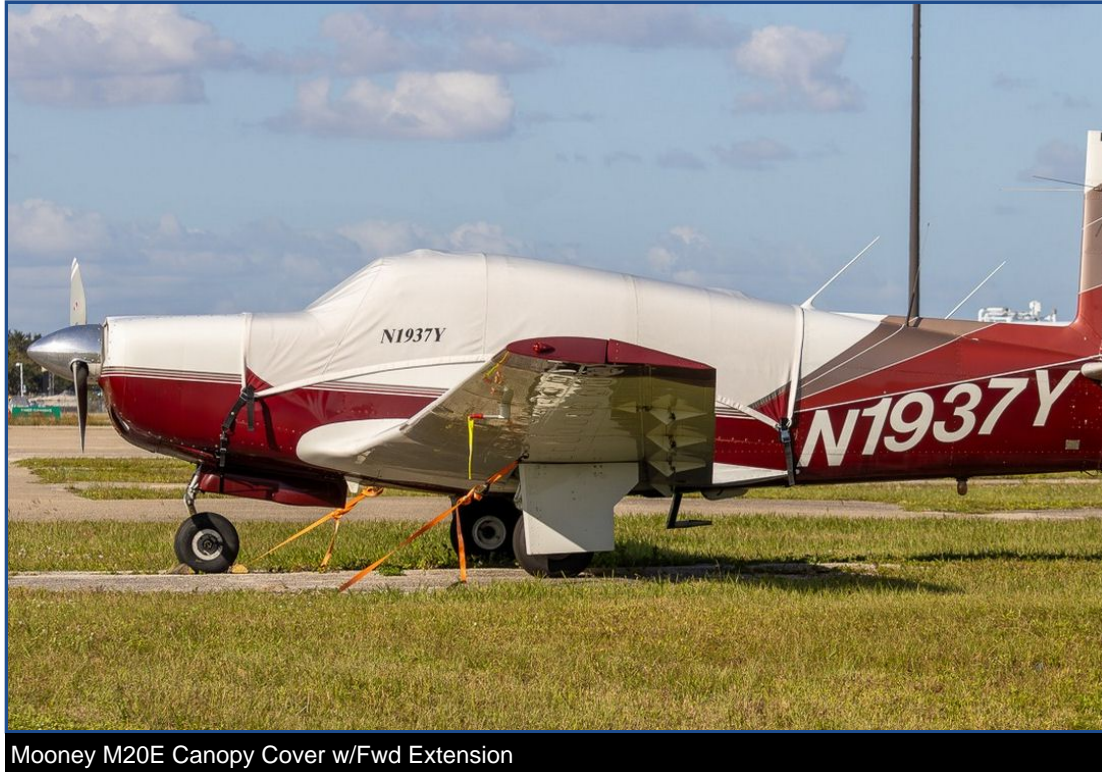
Mooney M20E Canopy Cover w/Fwd Extension