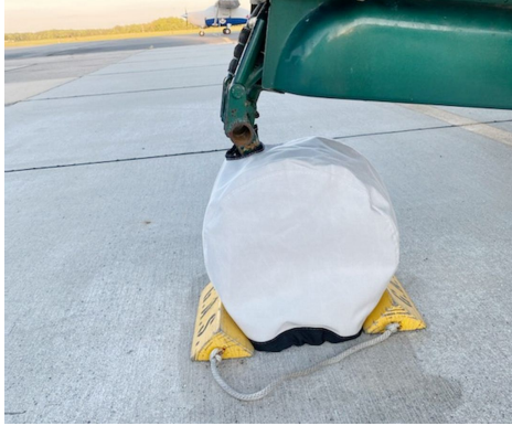
Mooney 201 Nose Wheel Cover

The Mooney Early M20 Series Tailcone Cover fits onto the tailcone area to cover the holes that birds can fly into and nest. The cover easily straps onto the leading edge of the horizontal stabilizer with padded hooks or overlaps with the elevators slightly and attaches under the horizontal stabilizers with adjustable straps. Tailcone Covers are normally made with Solution-Dyed Polyester or Acrylic Sunbrella .