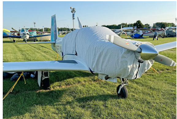
Mooney M20C Canopy/Engine Cover (1964 & before)