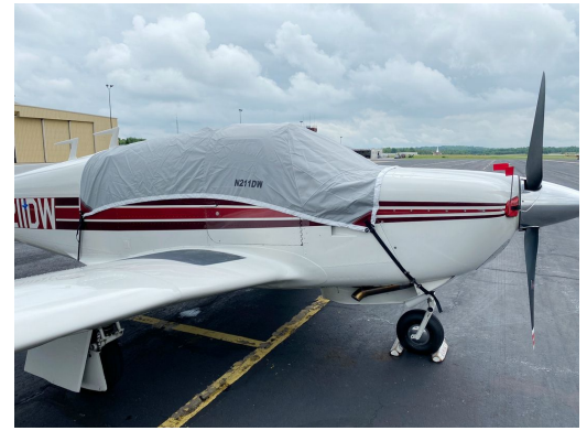
Mooney M20F Travel Weight Canopy Cover