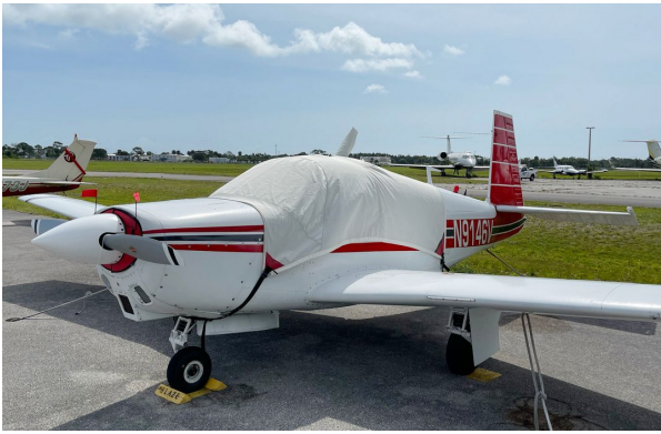
Mooney M20C Engine Plugs