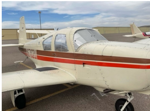
Mooney M20C Heatshield Set

Windshield Heatshields are interior sunshades for an aircraft's front windshield. The product is a unique composite of closed-cell foam with a silver mylar finish. The semi-rigid design is stiff enough to stand along the inside of the windshield using sun visors or window framing. It folds up flat and easily stores in the included storage sleeve. Some designs may require velcro and suction cups or split right and left sides. A Heatshield is an excellent short-term remedy for cockpit overheating. An external fabric cover is far more effective and practical for long-term protection.