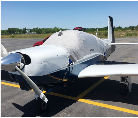
Mooney Early M20 Series Canopy Cover w/Fwd Avionics Panel Cover