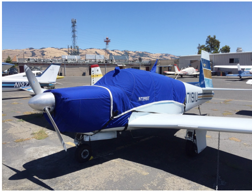
Mooney M20 Canopy & Engine Cover