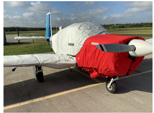
Mooney M20C Winter Cover Set