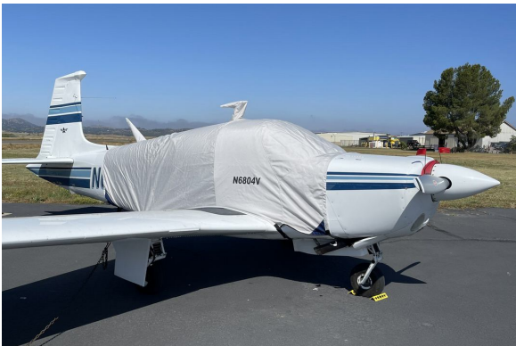
Mooney M20E Extended Canopy Cover

This cover type is made from Silver Acrylic Sunbrella canvas and is 100% lined with a soft and smooth microfiber. Bruce's Custom Covers developed this material combination especially for aircraft protection. The outer material is medium weight and treated for water resistance, UV resistance and anti-static buildup. The inner lining is a very soft and smooth microfiber to prevent scratching. The material is very reflective, and tests show that the cabin interior temperature can be reduced to near-ambient temperature on the hottest of days. It is water, ice and snow repellent, yet breathable to allow moisture to escape from between the cover and the aircraft surface.