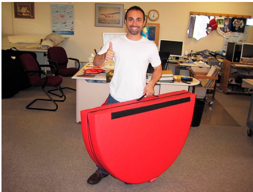
Boeing 737 FOD protection Intake Plug, folding type

The Engine Inlet Plugs are custom fit for your Embraer EMB-170/175 intakes, made with heavy-duty vinyl material, and stuffed with a single block of sculpted urethane foam. Each plug has a zipper that allows the foam to be removed and dried if necessary. Engine plugs have 'remove before flight' streamers sewn onto the face of the plugs. Most plugs are imprinted with the aircraft registration number in black for an extra charge. Storage bag NOT included. Engine plugs may be inserted after flight when the engine is still warm. Engine Inlet Plugs are commonly referred to as Cowl Plugs, Intake Plugs, Cowl Blocks, Engine Blocks, and Engine Bungs.