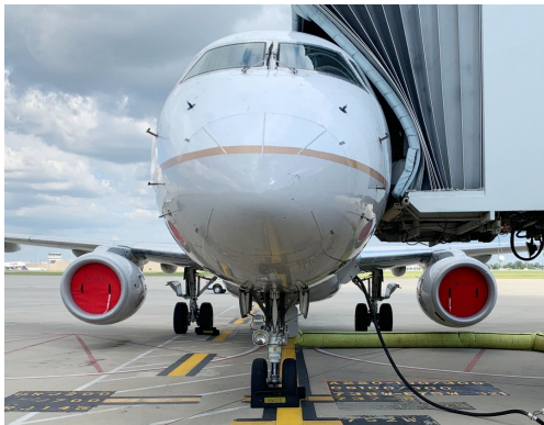
Embraer EMB-170/175 Engine Inlet Plugs

The Engine Inlet Plugs are custom fit for your Embraer EMB-170/175 intakes, made with heavy-duty vinyl material, and stuffed with a single block of sculpted urethane foam. Each plug has a zipper that allows the foam to be removed and dried if necessary. Engine plugs have 'remove before flight' streamers sewn onto the face of the plugs. Most plugs are imprinted with the aircraft registration number in black for an extra charge. Storage bag NOT included. Engine plugs may be inserted after flight when the engine is still warm. Engine Inlet Plugs are commonly referred to as Cowl Plugs, Intake Plugs, Cowl Blocks, Engine Blocks, and Engine Bungs.