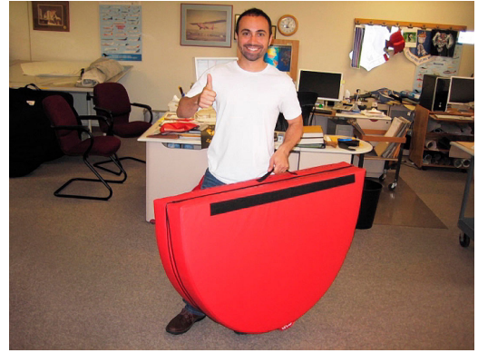
Boeing 737 FOD protection Intake Plug, folding type