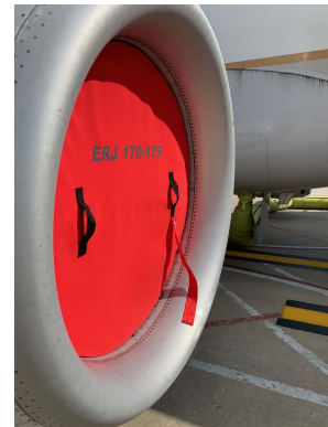
Embraer EMB-170/175 Engine Inlet Plugs