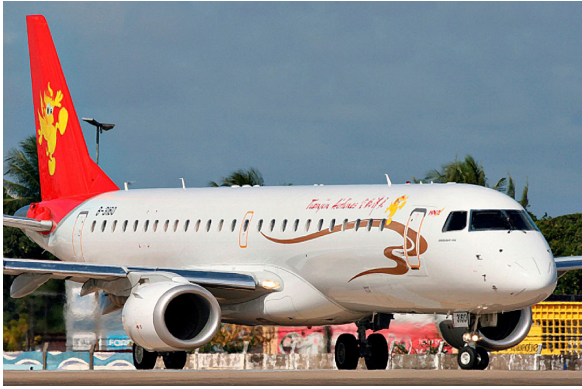
Covers, Plugs & HeatShields for Embraer 170/175/190/195