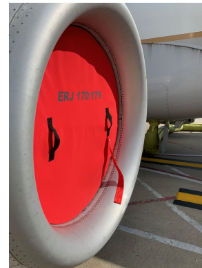
Embraer EMB-170/175 Engine Inlet Plugs