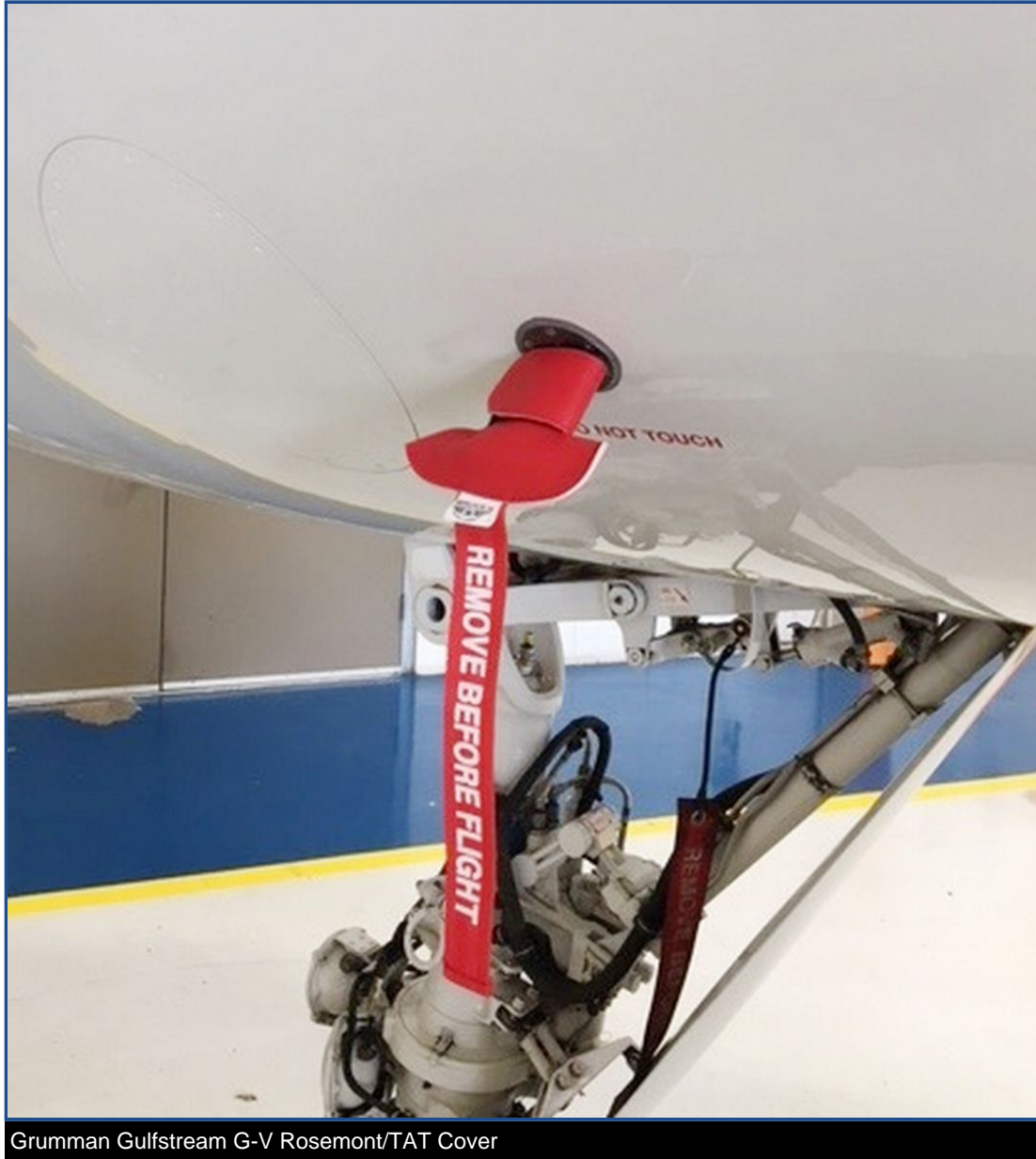
Grumman Gulfstream G-V Rosemont/TAT Cover