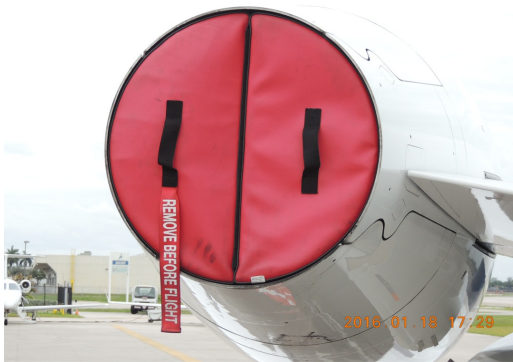
Embraer Legacy 500 Engine Exhaust Plug, folding type

The Embraer ERJ-135/140/145 Legacy 650 Pitot Tube Covers , made of Naugahyde vinyl, are designed to cover the entire pitot assembly. Slipping on over the tube, the cover tightens around the base with a special Velcro strap detail. A "remove before flight" streamer is attached to the cover. Heat Resistant Pitot Covers are designed to withstand more than 500 ° Fahrenheit, and will prevent the pitot cover from melting onto the tube if the pitot heat is accidentally turned on with the pitot cover attached.