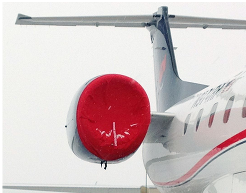
Embraer Legacy 650 Intake Covers

The Embraer ERJ-135/140/145 Legacy 650 Bikini Style Engine Covers are a single-piece design using a soft and smooth stretchy fabric. The cover stretches tightly over both the intake and exhaust, installing quickly and easily. These covers are designed to be used as hangar dust covers and have a useful life of approximately one year.