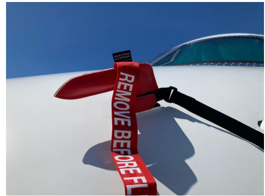
Embraer ERJ-135 Pitot/TAT/Ice Detector Covers