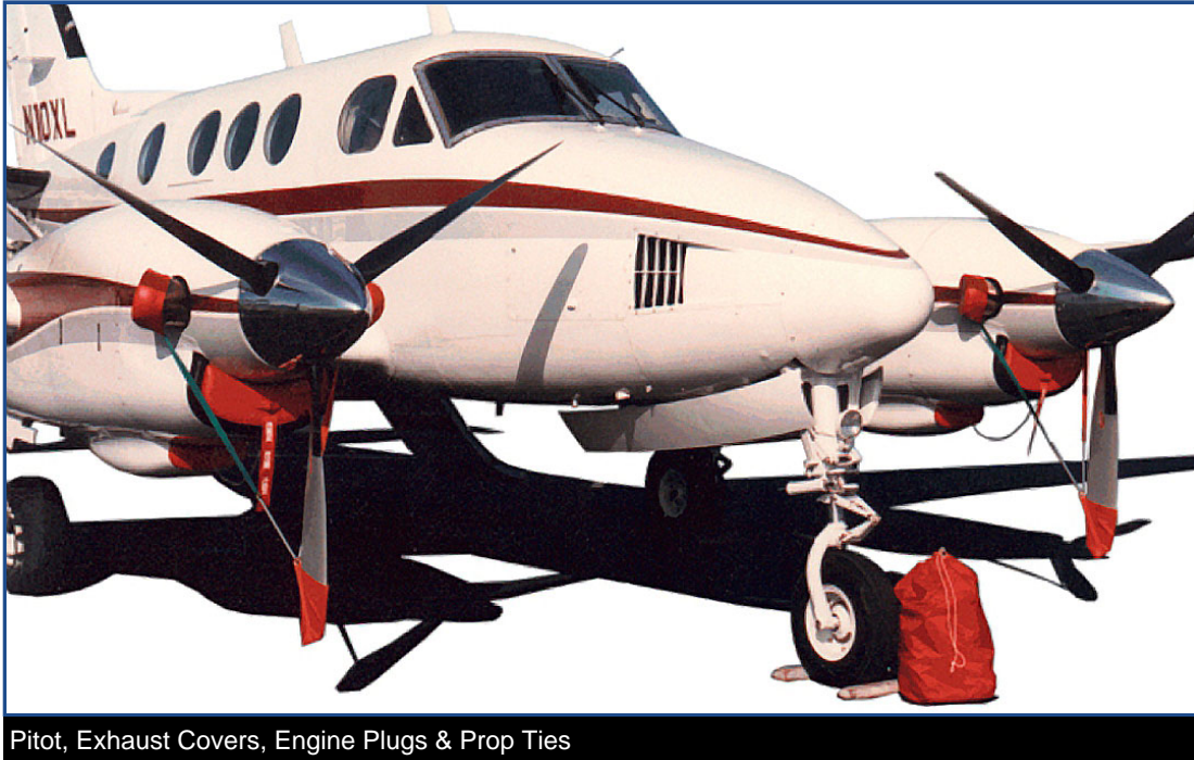
Pitot, Exhaust Covers, Engine Plugs &amp; Prop Ties