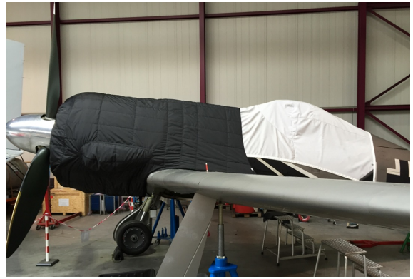
Focke Wulf 190 Canopy Cover & Insulated Engine Cover