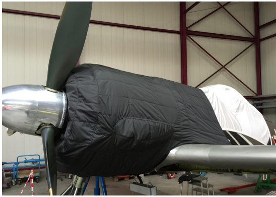
Focke Wulf 190 Canopy Cover & Insulated Engine Cover