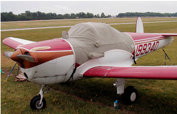
Ercoupe Canopy Cover, flat windshield model

the Canopy Cover and Engine Cover. This cover will enclose the engine cowl and will extend aft to cover all of the windows. This cover type is made from Silver Acrylic Sunbrella canvas and is 100% lined with a soft and smooth microfiber. Bruce's Custom Covers developed this material combination especially for aircraft protection. The outer material is medium weight and treated for water resistance, UV resistance and anti-static buildup. The inner lining is a very soft and smooth microfiber to prevent scratching. The material is very reflective, and tests show that the cabin interior temperature can be reduced to near-ambient temperature on the hottest of days. It is water, ice and snow repellent, yet breathable to allow moisture to escape from between the cover and the aircraft surface.