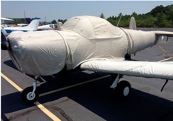
Ercoupe full cover set: Extended Canopy, Engine, Wing & Empennage covers