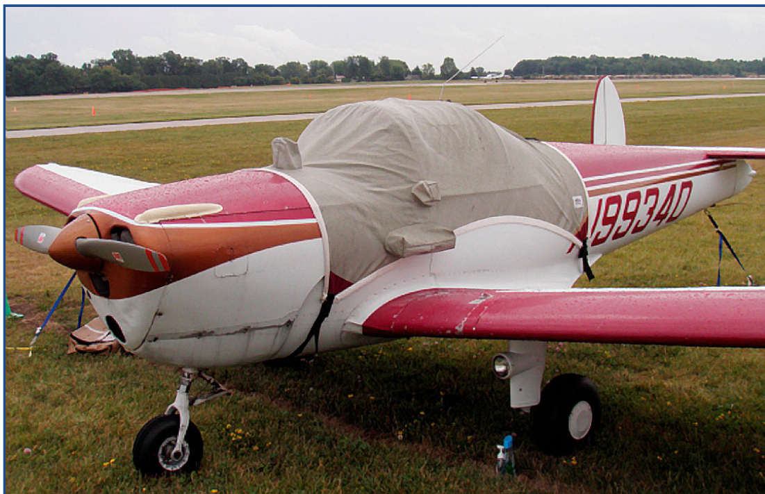
Ercoupe Canopy Cover, flat windshield model