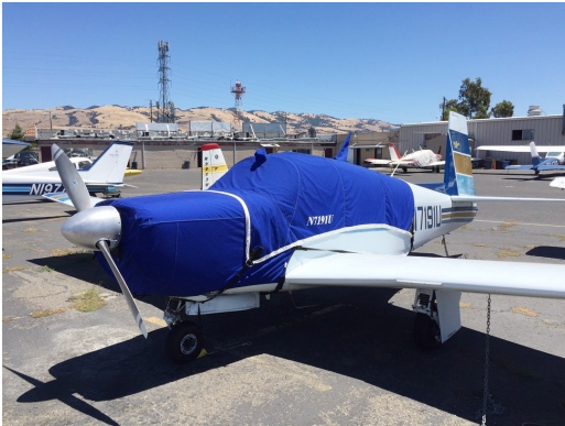
Mooney M20 Canopy & Engine Cover

This cover type is made from Silver Acrylic Sunbrella canvas and is 100% lined with a soft and smooth microfiber. Bruce's Custom Covers developed this material combination especially for aircraft protection. The outer material is medium weight and treated for water resistance, UV resistance and anti-static buildup. The inner lining is a very soft and smooth microfiber to prevent scratching. The material is very reflective, and tests show that the cabin interior temperature can be reduced to near-ambient temperature on the hottest of days. It is water, ice and snow repellent, yet breathable to allow moisture to escape from between the cover and the aircraft surface.