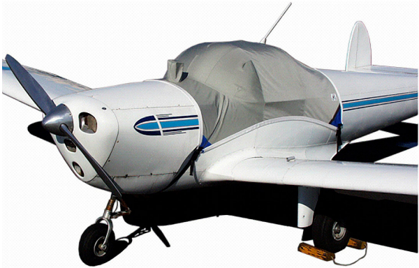
Ercoupe Canopy Cover, bubble windshield model

Travel Covers are made with Silver Solution-Dyed Polyester fabric and only lined over the windshield to save weight. The material is lightweight and more compact for easy stowage in the aircraft. The polyester material is water resistant, but only intended for occasional use outside. We also have an ultra lightweight material available for fitted hangar dust covers. For daily outdoor use, the non-travel Sunbrella Cover is the best choice.