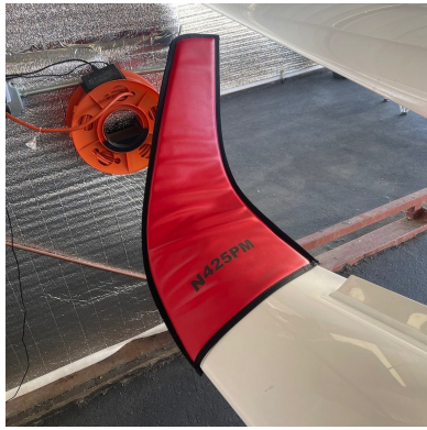
Stemme S-10 & S-12 Wingtip Pads