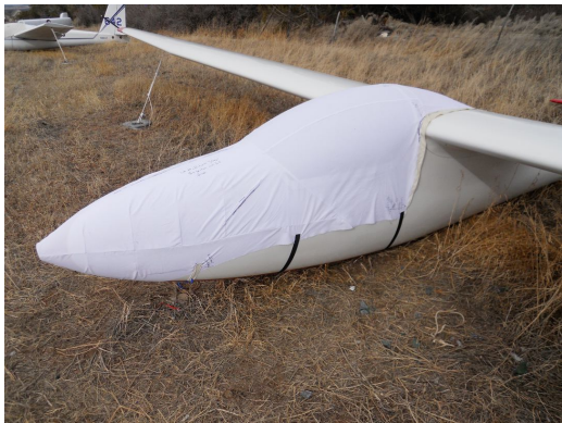
Laister LP-49 Canopy/Nose Cover, test fit cover

water resistance, UV resistance and anti-static buildup. The inner lining is a very soft and smooth microfiber to prevent scratching. The material is very reflective, and tests show that the cabin interior temperature can be reduced to near-ambient temperature on the hottest of days. It is water, ice and snow repellent, yet breathable to allow moisture to escape from between the cover and the aircraft surface.