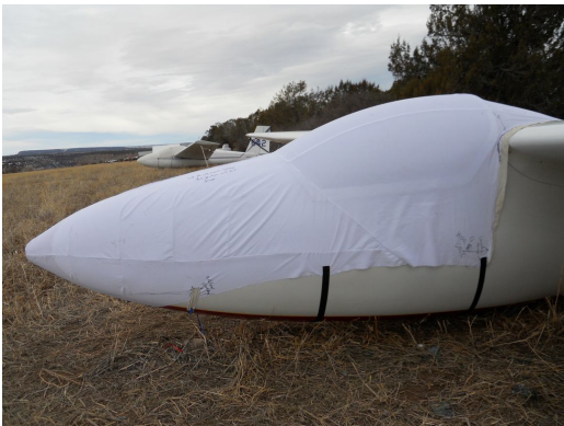
Laister LP-49 Canopy/Nose Cover, test fit cover