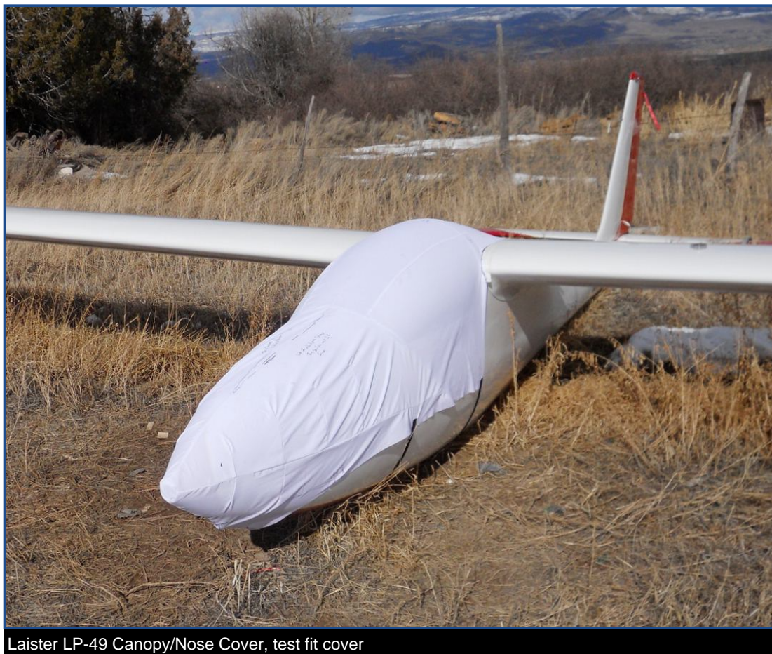
Laister LP-49 Canopy/Nose Cover, test fit cover