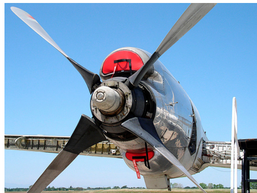
Lockheed P-3 Main Engine Inlet Plugs