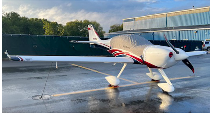
Lightning, XS, Travel Cover, Light Weight Canopy Cover

Travel Covers are made with Silver Solution-Dyed Polyester fabric and only lined over the windshield to save weight. The material is lightweight and more compact for easy stowage in the aircraft. The polyester material is water resistant, but only intended for occasional use outside. We also have an ultra lightweight material available for fitted hangar dust covers. For daily outdoor use, the non-travel Sunbrella Cover is the best choice.