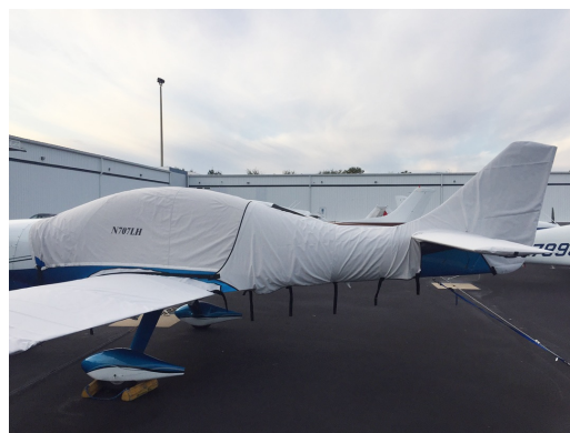
Lancair ES Wing Covers &amp; Empennage Cover (sold separately)