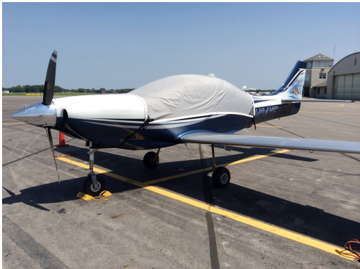
Lancair IV Light Weight Travel Canopy Cover