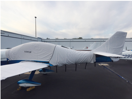
Lancair ES Wing Covers & Empennage Cover (sold separately)

This cover type is made from Silver Acrylic Sunbrella canvas and is 100% lined with a soft and smooth microfiber. Bruce's Custom Covers developed this material combination especially for aircraft protection. The outer material is medium weight and treated for water resistance, UV resistance and anti-static buildup. The inner lining is a very soft and smooth microfiber to prevent scratching. The material is very reflective, and tests show that the cabin interior temperature can be reduced to near-ambient temperature on the hottest of days. It is water, ice and snow repellent, yet breathable to allow moisture to escape from between the cover and the aircraft surface.