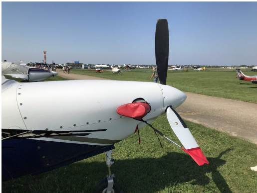
Lancair IV Prop Tie/Exhaust Covers