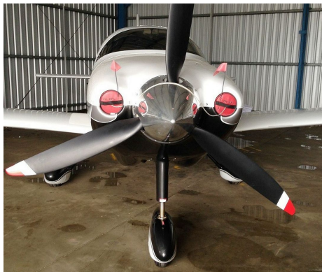
Columbia 350 Engine Plugs

Engine Inlet Plugs are custom fit for your Lancair IV, LX7 intakes, made with heavy-duty vinyl material, and stuffed with a single block of sculpted urethane foam. Each plug has a zipper that allows the foam to be removed and dried if necessary. Engine plugs have warning flags that are visible from the cockpit or 'remove before flight' streamers sewn onto the face of the plugs. Most plugs are imprinted with the aircraft registration number in black for an extra charge. Storage bag NOT included. Engine plugs may be inserted after flight when the engine is still warm. Engine Inlet Plugs are commonly referred to as Cowl Plugs, Intake Plugs, Cowl Blocks, Engine Blocks, and Engine Bungs.