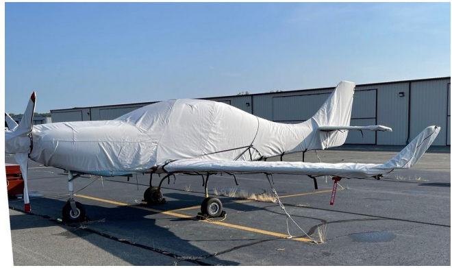
Lancair IV Complete Cover Set