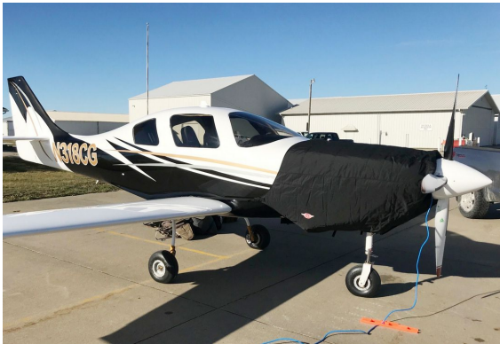
Lancair IV-P Insulated Engine Cover, fully enclosed

This cover type is made from Silver Acrylic Sunbrella canvas and is 100% lined with a soft and smooth microfiber. Bruce's Custom Covers developed this material combination especially for aircraft protection. The outer material is medium weight and treated for water resistance, UV resistance and anti-static buildup. The inner lining is a very soft and smooth microfiber to prevent scratching. The material is very reflective, and tests show that the cabin interior temperature can be reduced to near-ambient temperature on the hottest of days. It is water, ice and snow repellent, yet breathable to allow moisture to escape from between the cover and the aircraft surface.