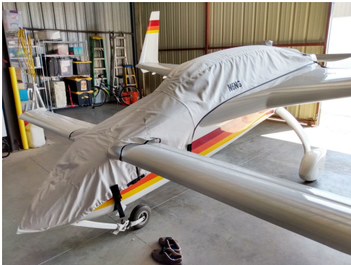
Rutan Long-EZ Canopy/Nose Cover

Travel Covers are made with Silver Solution-Dyed Polyester fabric and only lined over the windshield to save weight. The material is lightweight and more compact for easy stowage in the aircraft. The polyester material is water resistant, but only intended for occasional use outside. We also have an ultra lightweight material available for fitted hangar dust covers. For daily outdoor use, the non-travel Sunbrella Cover is the best choice.