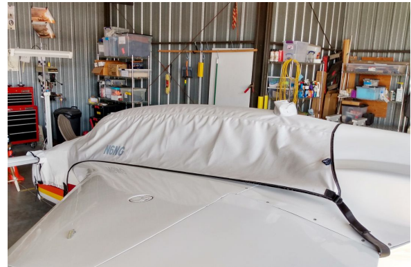
Rutan Long-EZ Canopy/Nose Cover