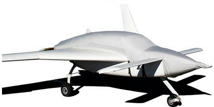
Velocity Canopy/Nose/Engine Cover