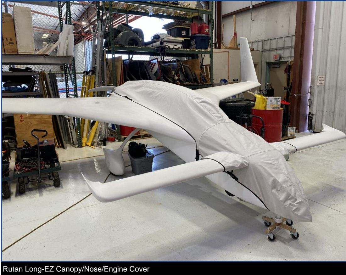
Rutan Long-EZ Canopy/Nose/Engine Cover