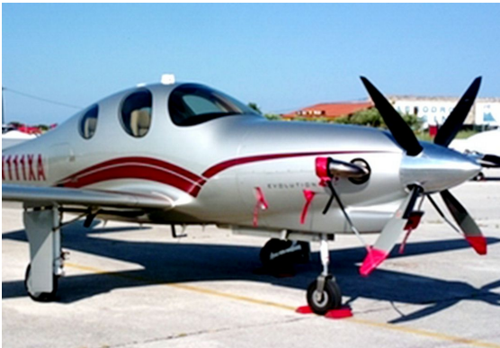
Lancair Evolution Red Gear