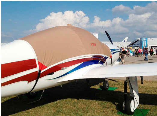
Lancair Evolution Canopy Cover

This cover type is made from Silver Acrylic Sunbrella canvas and is 100% lined with a soft and smooth microfiber. Bruce's Custom Covers developed this material combination especially for aircraft protection. The outer material is medium weight and treated for water resistance, UV resistance and anti-static buildup. The inner lining is a very soft and smooth microfiber to prevent scratching. The material is very reflective, and tests show that the cabin interior temperature can be reduced to near-ambient temperature on the hottest of days. It is water, ice and snow repellent, yet breathable to allow moisture to escape from between the cover and the aircraft surface.