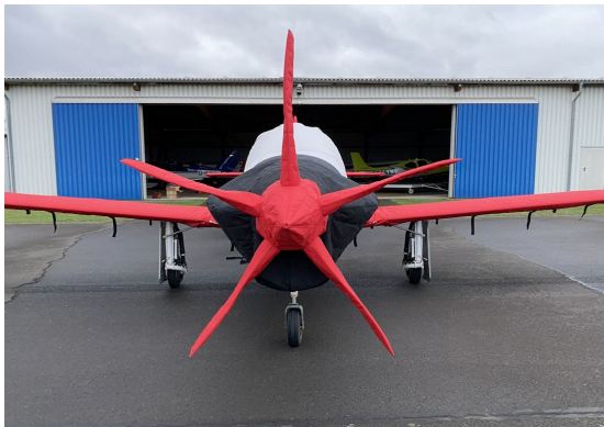
Lancair Evolution Wing Covers, Insulated Engine & Prop Covers

WINTER USE MATERIAL - Made with Solution-Dyed Polyester fabric, this option is intended for seasonal use to aid in deicing, rain mitigation, or for occasional travel. The material is lighter and more compact, but more susceptible to UV damage and may have a shorter useful life if used continuously outside than the all-year use material.