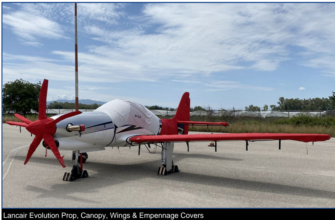
Lancair Evolution Prop, Canopy, Wings & Empennage Covers