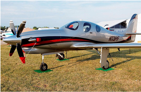
Lancair Evolution Prop Tie-Exhaust Covers

This cover type is made from Silver Acrylic Sunbrella canvas and is 100% lined with a soft and smooth microfiber. Bruce's Custom Covers developed this material combination especially for aircraft protection. The outer material is medium weight and treated for water resistance, UV resistance and anti-static buildup. The inner lining is a very soft and smooth microfiber to prevent scratching. The material is very reflective, and tests show that the cabin interior temperature can be reduced to near-ambient temperature on the hottest of days. It is water, ice and snow repellent, yet breathable to allow moisture to escape from between the cover and the aircraft surface.