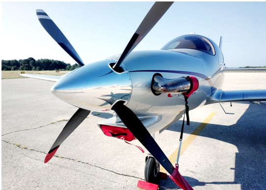
Lancair Evolution Red Gear

Engine Inlet Plugs are custom fit for your Lancair Evolution intakes, made with heavy-duty vinyl material, and stuffed with a single block of sculpted urethane foam. Each plug has a zipper that allows the foam to be removed and dried if necessary. Engine plugs have warning flags that are visible from the cockpit or 'remove before flight' streamers sewn onto the face of the plugs. Most plugs are imprinted with the aircraft registration number in black for an extra charge. Storage bag NOT included. Engine plugs may be inserted after flight when the engine is still warm. Engine Inlet Plugs are commonly referred to as Cowl Plugs, Intake Plugs, Cowl Blocks, Engine Blocks, and Engine Bungs.