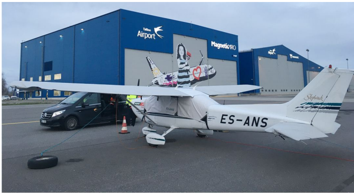
Cessna 172R Wing Covers