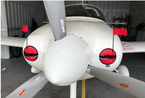
Lancair ES Engine Inlet Plugs