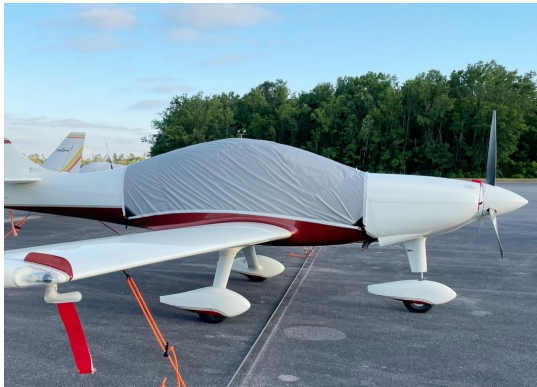
Lancair ES Travel Weight Canopy Cover