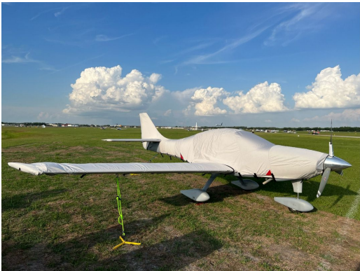
Lancair ES Complete Cover Set