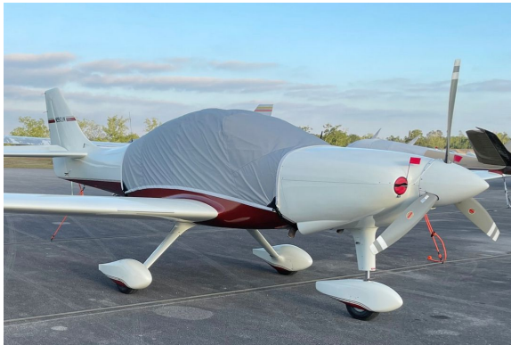
Lancair ES Travel Weight Canopy Cover

Travel Covers are made with Silver Solution-Dyed Polyester fabric and only lined over the windshield to save weight. The material is lightweight and more compact for easy stowage in the aircraft. The polyester material is water resistant, but only intended for occasional use outside. We also have an ultra lightweight material available for fitted hangar dust covers. For daily outdoor use, the non-travel Sunbrella Cover is the best choice.