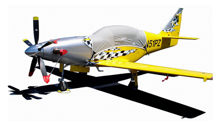
Legend Canopy Cover, Prop Ties, Exhaust Covers & Intake Plugs

This cover type is made from Silver Acrylic Sunbrella canvas and is 100% lined with a soft and smooth microfiber. Bruce's Custom Covers developed this material combination especially for aircraft protection. The outer material is medium weight and treated for water resistance, UV resistance and anti-static buildup. The inner lining is a very soft and smooth microfiber to prevent scratching. The material is very reflective, and tests show that the cabin interior temperature can be reduced to near-ambient temperature on the hottest of days. It is water, ice and snow repellent, yet breathable to allow moisture to escape from between the cover and the aircraft surface.