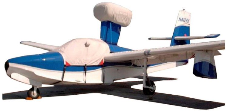
Lake Canopy & Engine Covers