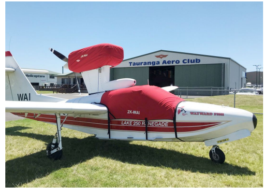
Lake Renegade Cabin & Engine Covers