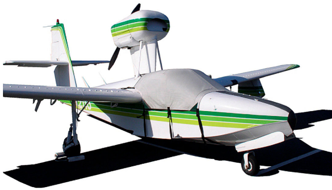
Lake LA-250 Canopy Cover

This cover type is made from Silver Acrylic Sunbrella canvas and is 100% lined with a soft and smooth microfiber. Bruce's Custom Covers developed this material combination especially for aircraft protection. The outer material is medium weight and treated for water resistance, UV resistance and anti-static buildup. The inner lining is a very soft and smooth microfiber to prevent scratching. The material is very reflective, and tests show that the cabin interior temperature can be reduced to near-ambient temperature on the hottest of days. It is water, ice and snow repellent, yet breathable to allow moisture to escape from between the cover and the aircraft surface.