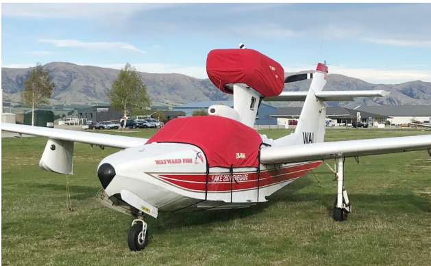
Lake Renegade Cabin & Engine Covers

This cover type is made from Silver Acrylic Sunbrella canvas and is 100% lined with a soft and smooth microfiber. Bruce's Custom Covers developed this material combination especially for aircraft protection. The outer material is medium weight and treated for water resistance, UV resistance and anti-static buildup. The inner lining is a very soft and smooth microfiber to prevent scratching. The material is very reflective, and tests show that the cabin interior temperature can be reduced to near-ambient temperature on the hottest of days. It is water, ice and snow repellent, yet breathable to allow moisture to escape from between the cover and the aircraft surface.