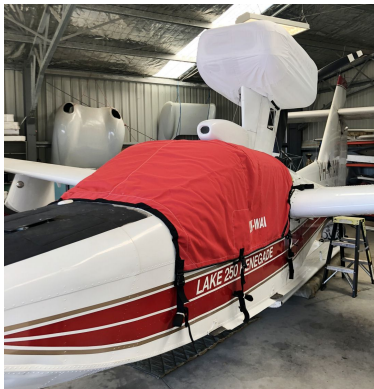
Lake LA250 Renegade Cockpit Cover, Engine Cover (test fit)