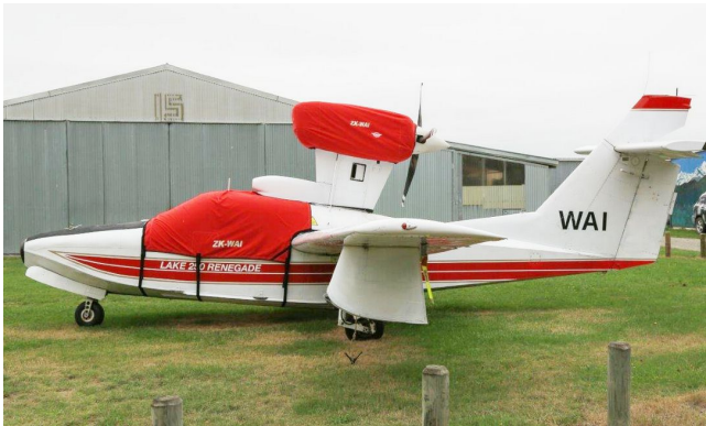
Lake Renegade Canopy & Engine Covers