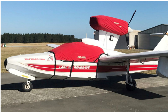
Lake Renegade Cabin & Engine Covers

This cover type is made from Silver Acrylic Sunbrella canvas and is 100% lined with a soft and smooth microfiber. Bruce's Custom Covers developed this material combination especially for aircraft protection. The outer material is medium weight and treated for water resistance, UV resistance and anti-static buildup. The inner lining is a very soft and smooth microfiber to prevent scratching. The material is very reflective, and tests show that the cabin interior temperature can be reduced to near-ambient temperature on the hottest of days. It is water, ice and snow repellent, yet breathable to allow moisture to escape from between the cover and the aircraft surface.