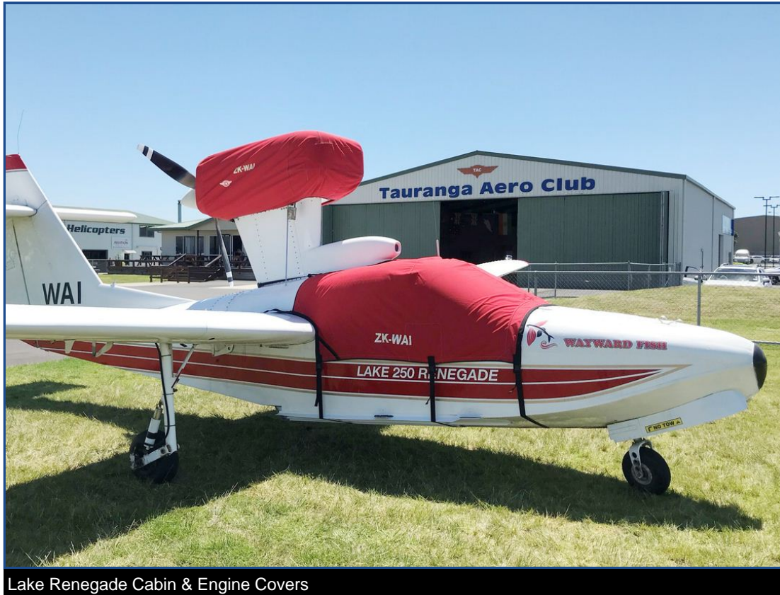
Lake Renegade Cabin &amp; Engine Covers