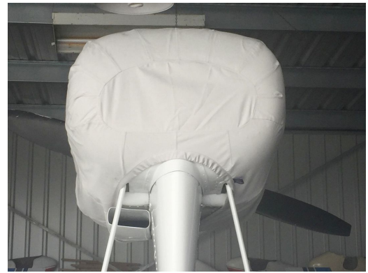
Lake LA-4 Buccaneer Engine Cover