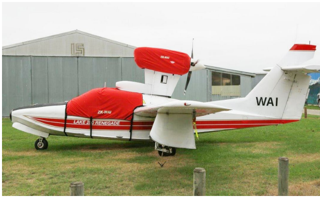
Lake Renegade Canopy & Engine Covers

This cover type is made from Silver Acrylic Sunbrella canvas and is 100% lined with a soft and smooth microfiber. Bruce's Custom Covers developed this material combination especially for aircraft protection. The outer material is medium weight and treated for water resistance, UV resistance and anti-static buildup. The inner lining is a very soft and smooth microfiber to prevent scratching. The material is very reflective, and tests show that the cabin interior temperature can be reduced to near-ambient temperature on the hottest of days. It is water, ice and snow repellent, yet breathable to allow moisture to escape from between the cover and the aircraft surface.