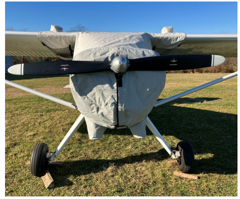
Luscombe 8A Canopy Cover, Insulated Engine Cover