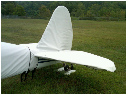
Luscombe Empennage Cover, two-piece design

WINTER USE MATERIAL - Made with Solution-Dyed Polyester fabric, this option is intended for seasonal use to aid in deicing, rain mitigation, or for occasional travel. The material is lighter and more compact, but more susceptible to UV damage and may have a shorter useful life if used continuously outside than the all-year use material.