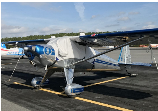
Luscombe Model 8 Over-Top Canopy Cover, extends to cover wing tanks.

This cover type is made from Silver Acrylic Sunbrella canvas and is 100% lined with a soft and smooth microfiber. Bruce's Custom Covers developed this material combination especially for aircraft protection. The outer material is medium weight and treated for water resistance, UV resistance and anti-static buildup. The inner lining is a very soft and smooth microfiber to prevent scratching. The material is very reflective, and tests show that the cabin interior temperature can be reduced to near-ambient temperature on the hottest of days. It is water, ice and snow repellent, yet breathable to allow moisture to escape from between the cover and the aircraft surface.