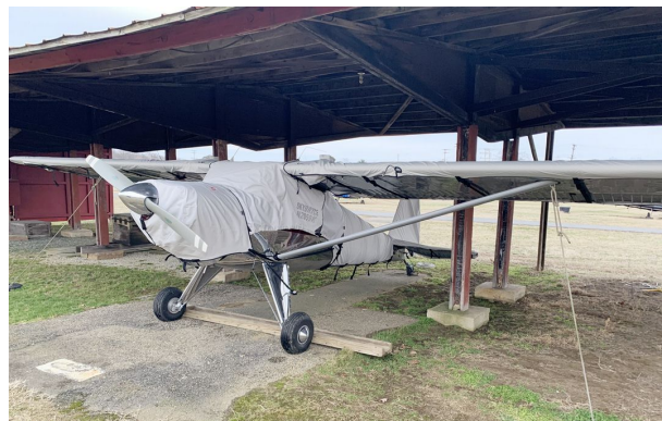
Luscombe Canopy, Wings, Engine & Empennage Covers