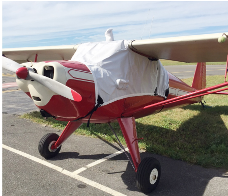
Luscombe Over-Top Canopy Cover

This cover type is made from Silver Acrylic Sunbrella canvas and is 100% lined with a soft and smooth microfiber. Bruce's Custom Covers developed this material combination especially for aircraft protection. The outer material is medium weight and treated for water resistance, UV resistance and anti-static buildup. The inner lining is a very soft and smooth microfiber to prevent scratching. The material is very reflective, and tests show that the cabin interior temperature can be reduced to near-ambient temperature on the hottest of days. It is water, ice and snow repellent, yet breathable to allow moisture to escape from between the cover and the aircraft surface.