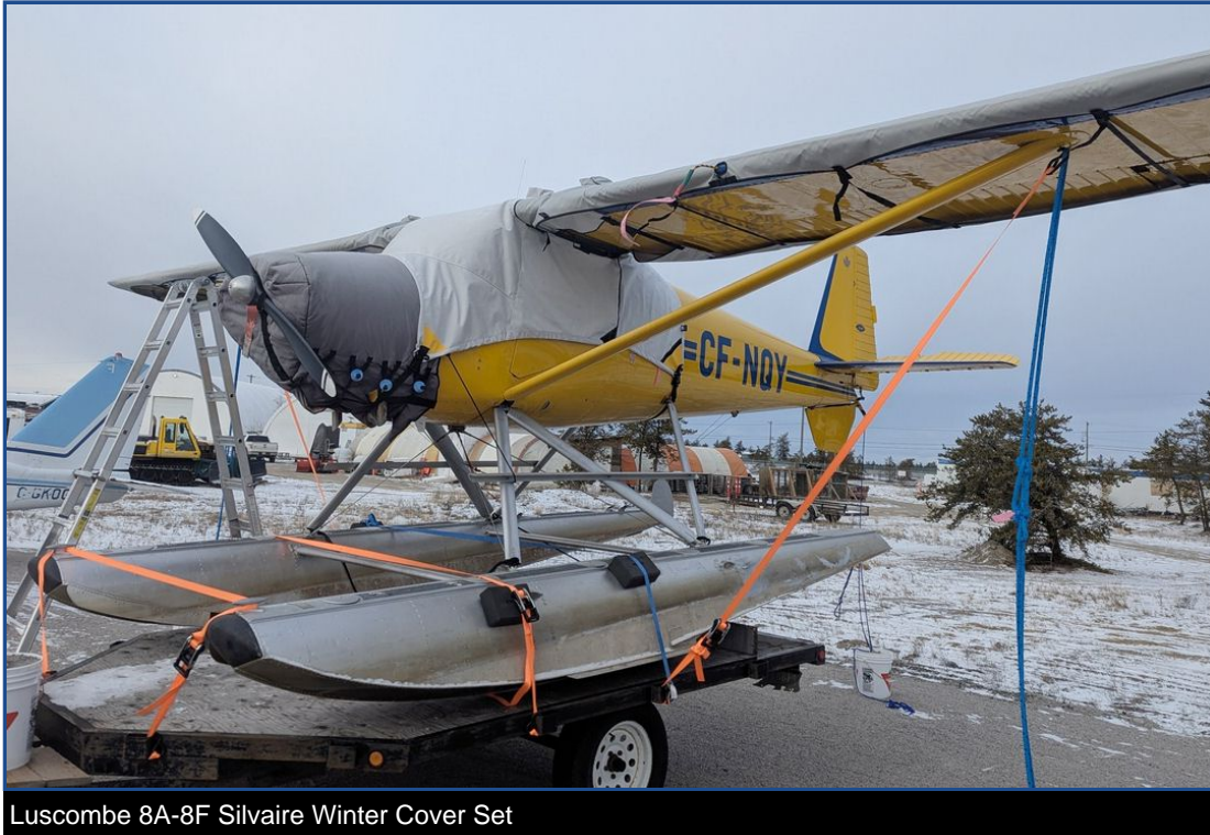
Luscombe 8A-8F Silvaire Winter Cover Set