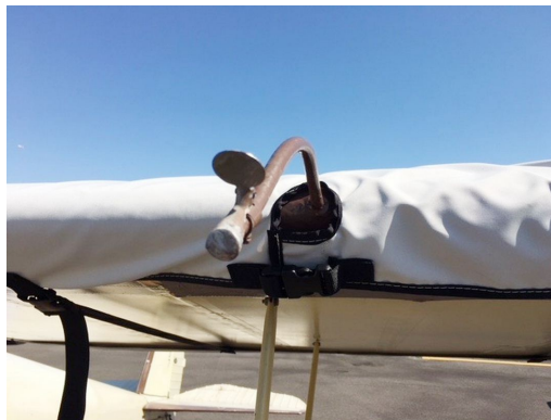
Luscombe 8A-8F Silvaire Wing Covers, Pitot Tube detail.