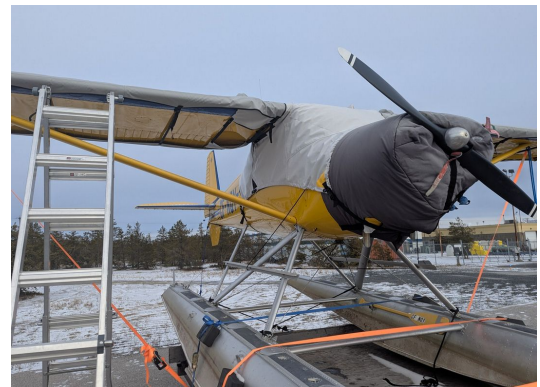
Luscombe 8A-8F Silvaire Winter Cover Set