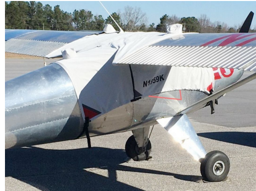
Luscombe Over-Top Canopy Cover