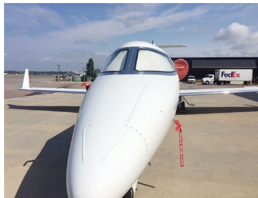
Lear Models 40 &amp; 45 Cockpit Heatshields, Covers All Cockpit Windows

Cockpit Heatshields are interior sunshades for the aircraft's cockpit. The product is a unique composite of closed-cell foam with a silver mylar finish. The semi-rigid design is stiff enough to stand inside the window framing. The set folds up flat and is easily stored in the included storage sleeve. Some designs may require velcro and suction cups. Our Heatshields for jets are offered white side out because some aircraft manufacturers have issued advisories against reflective window inserts due to potential heat damage. A Heatshield is an excellent short-term remedy for cockpit overheating, but an external fabric cover is more effective for long-term protection.