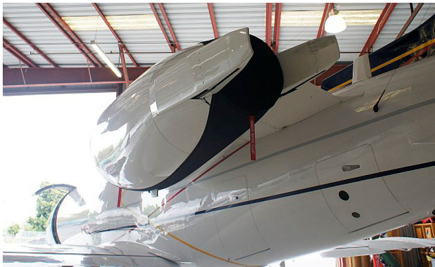
Lear 60 "Bikini Style" Engine Covers

The Lear 85 Bikini Style Engine Covers are a single-piece design using a soft and smooth stretchy and fabric. The cover stretches tightly over both the intake and exhaust, installing quickly and easily. These covers are designed to be used as hangar dust covers and have a useful life of approximately one year.