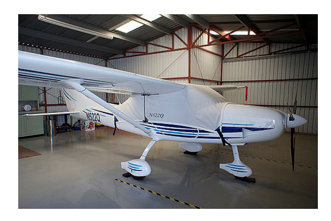
TL Ultralight Sirius Canopy Cover

This cover type is made from Silver Acrylic Sunbrella canvas and is 100% lined with a soft and smooth microfiber. Bruce's Custom Covers developed this material combination especially for aircraft protection. The outer material is medium weight and treated for water resistance, UV resistance and anti-static buildup. The inner lining is a very soft and smooth microfiber to prevent scratching. The material is very reflective, and tests show that the cabin interior temperature can be reduced to near-ambient temperature on the hottest of days. It is water, ice and snow repellent, yet breathable to allow moisture to escape from between the cover and the aircraft surface.