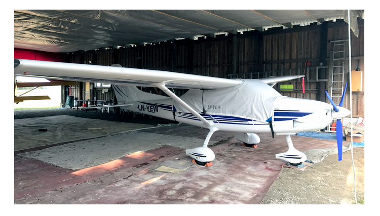
TL Ultralight Sirius TL-3000 Canopy Cover (Over-The-Top Style)