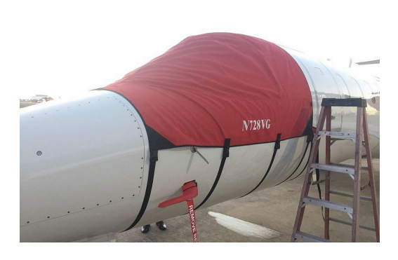
Learjet 45 Cockpit Cover