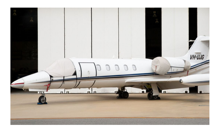
Lear 60 Cockpit Cover, Tri-Fold Engine Covers