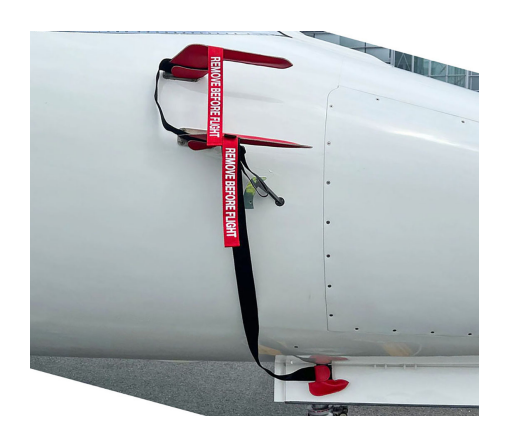
Lear 60 Pitot Covers W/Aoa Strap, Tat Covers, Heat Resistant Type