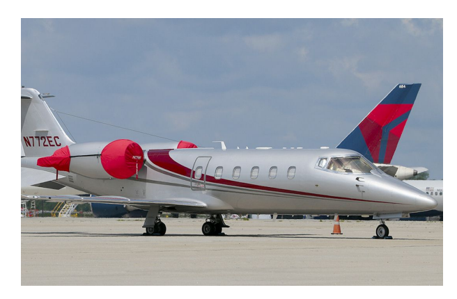
Lear 60 Cockpit Heatshields, Tri-Fold Engine Covers

Cockpit Heatshields are interior sunshades for the aircraft's cockpit. The product is a unique composite of closed-cell foam with a silver mylar finish. The semi-rigid design is stiff enough to stand inside the window framing. The set folds up flat and is easily stored in the included storage sleeve. Some designs may require velcro and suction cups. Our Heatshields for jets are offered white side out because some aircraft manufacturers have issued advisories against reflective window inserts due to potential heat damage. A Heatshield is an excellent short-term remedy for cockpit overheating, but an external fabric cover is more effective for long-term protection.