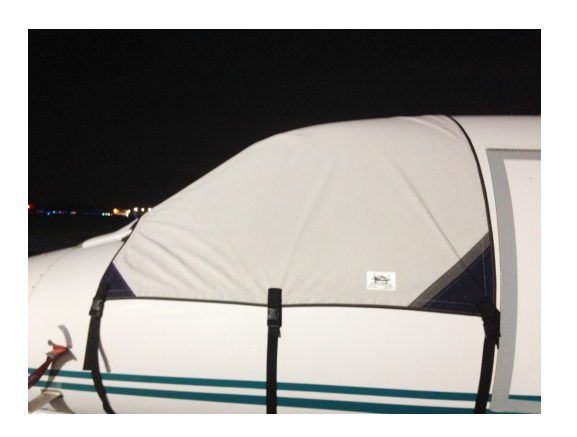
Lear 31 Cockpit Cover