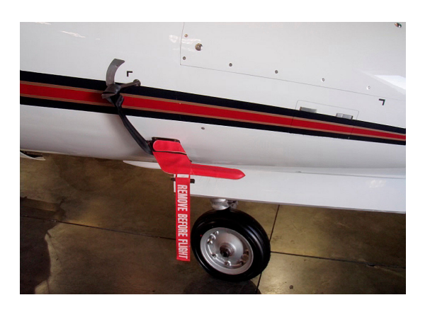
Learjet Heat Resistant Pitot Cover with AOA strap