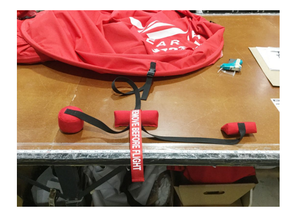
Lear 60 Engine Cover with nacelle plugs