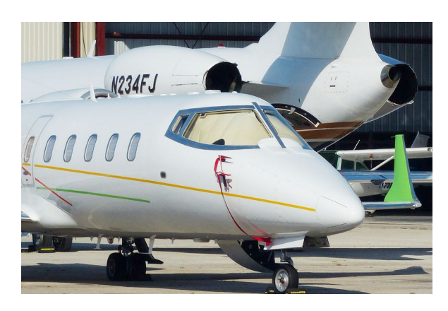
Lear 60 Cockpit Heatshields