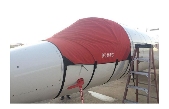
Learjet 45 Cockpit Cover

This cover type is made from Silver Acrylic Sunbrella canvas and is 100% lined with a soft and smooth microfiber. Bruce's Custom Covers developed this material combination especially for aircraft protection. The outer material is medium weight and treated for water resistance, UV resistance and anti-static buildup. The inner lining is a very soft and smooth microfiber to prevent scratching. The material is very reflective, and tests show that the cabin interior temperature can be reduced to near-ambient temperature on the hottest of days. It is water, ice and snow repellent, yet breathable to allow moisture to escape from between the cover and the aircraft surface.