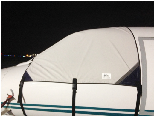
Lear 31 Cockpit Cover