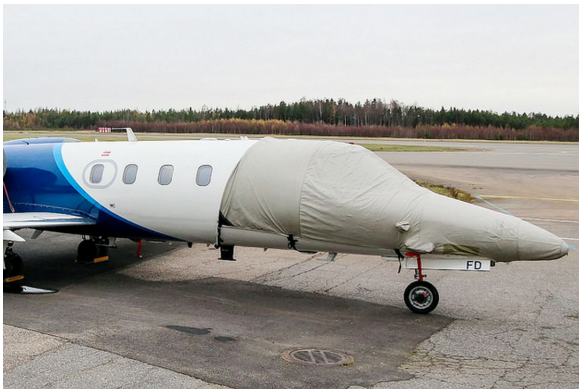
Learjet Cockpit/Nose Cover

This cover type is made from Silver Acrylic Sunbrella canvas and is 100% lined with a soft and smooth microfiber. Bruce's Custom Covers developed this material combination especially for aircraft protection. The outer material is medium weight and treated for water resistance, UV resistance and anti-static buildup. The inner lining is a very soft and smooth microfiber to prevent scratching. The material is very reflective, and tests show that the cabin interior temperature can be reduced to near-ambient temperature on the hottest of days. It is water, ice and snow repellent, yet breathable to allow moisture to escape from between the cover and the aircraft surface.