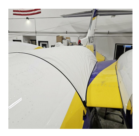
Lear 45 Empennage Saddle Cover W/ Dorsal Inlet Plug (Covers Upper Fuselage Between Pylons, Acm/Apu Area) Lear 45 Empennage Saddle Cover W/ Dorsal Inlet Plug (Covers Upper Fuselage Between Pylons, Acm/Apu Area)