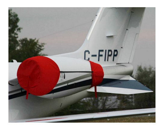
Lear 45 Engine Covers