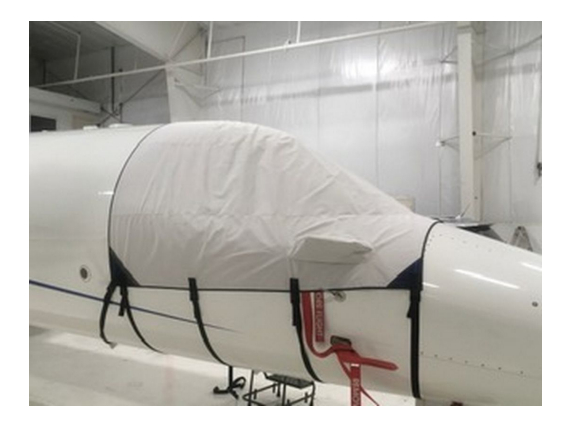
Lear 45 Cockpit Cover

This cover type is made from Silver Acrylic Sunbrella canvas and is 100% lined with a soft and smooth microfiber. Bruce's Custom Covers developed this material combination especially for aircraft protection. The outer material is medium weight and treated for water resistance, UV resistance and anti-static buildup. The inner lining is a very soft and smooth microfiber to prevent scratching. The material is very reflective, and tests show that the cabin interior temperature can be reduced to near-ambient temperature on the hottest of days. It is water, ice and snow repellent, yet breathable to allow moisture to escape from between the cover and the aircraft surface.