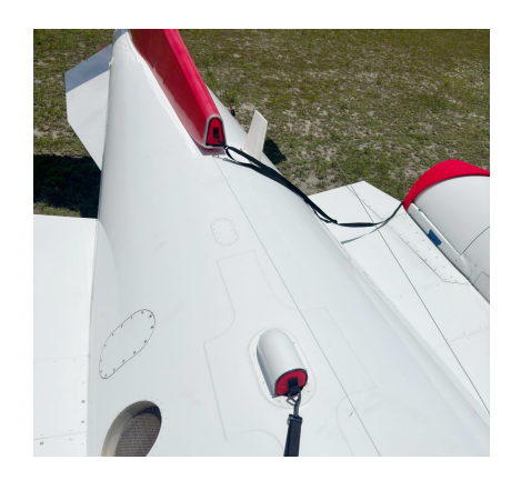
Lear 45 Dorsal, ACM & Fuel Vent Inlet Plugs

The Engine Inlet Plugs are custom fit for your Lear Models 40 & 45 intakes, made with heavy-duty vinyl material, and stuffed with a single block of sculpted urethane foam. Each plug has a zipper that allows the foam to be removed and dried if necessary. Engine plugs have 'remove before flight' streamers sewn onto the face of the plugs. Most plugs are imprinted with the aircraft registration number in black for an extra charge. Storage bag NOT included. Engine plugs may be inserted after flight when the engine is still warm. Engine Inlet Plugs are commonly referred to as Cowl Plugs, Intake Plugs, Cowl Blocks, Engine Blocks, and Engine Bungs.