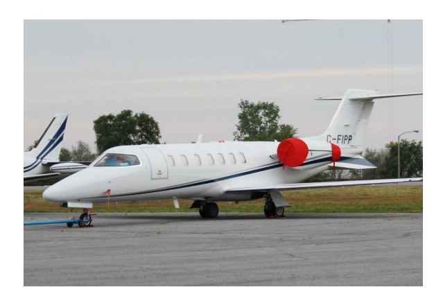
Lear 45 Engine Covers

The Lear Models 40 & 45 Bikini Style Engine Covers are a single-piece design using a soft and smooth stretchy and fabric. The cover stretches tightly over both the intake and exhaust, installing quickly and easily. These covers are designed to be used as hangar dust covers and have a useful life of approximately one year.