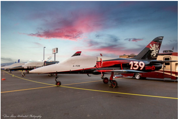
Aero L39 Canopy/Nose Cover