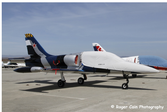
L-39 Canopy/Nose Cover & Plugs