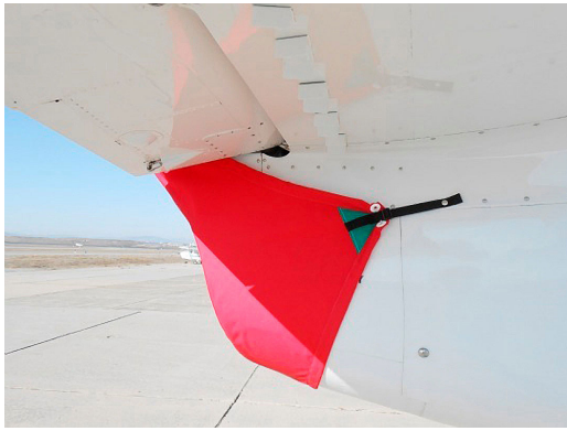
Aero L-39 Exhaust Cover, Snap-On Type