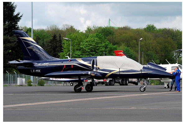
Aero L39 Canopy Cover