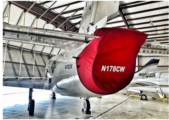
Aero L-39 & L-59 Albatros Exhaust Cover