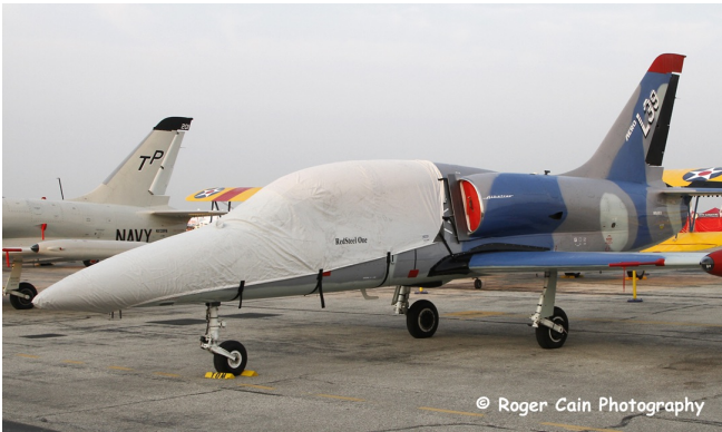
Aero L-39 Canopy/Nose Cover, Engine Plugs

This cover type is made from Silver Acrylic Sunbrella canvas and is 100% lined with a soft and smooth microfiber. Bruce's Custom Covers developed this material combination especially for aircraft protection. The outer material is medium weight and treated for water resistance, UV resistance and anti-static buildup. The inner lining is a very soft and smooth microfiber to prevent scratching. The material is very reflective, and tests show that the cabin interior temperature can be reduced to near-ambient temperature on the hottest of days. It is water, ice and snow repellent, yet breathable to allow moisture to escape from between the cover and the aircraft surface.