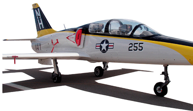
L-39 Intake Plugs