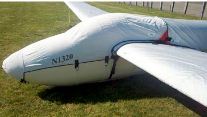
Schweizer SGS 1-26B Canopy/Nose, Wings & Empennage Covers