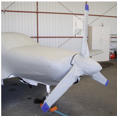
Lancair 360 Prop Cover

This cover type is made from Silver Acrylic Sunbrella canvas and is 100% lined with a soft and smooth microfiber. Bruce's Custom Covers developed this material combination especially for aircraft protection. The outer material is medium weight and treated for water resistance, UV resistance and anti-static buildup. The inner lining is a very soft and smooth microfiber to prevent scratching. The material is very reflective, and tests show that the cabin interior temperature can be reduced to near-ambient temperature on the hottest of days. It is water, ice and snow repellent, yet breathable to allow moisture to escape from between the cover and the aircraft surface.