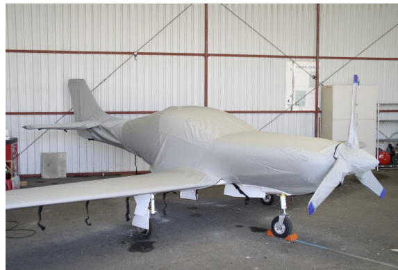
Lancair 360 Complete Cover