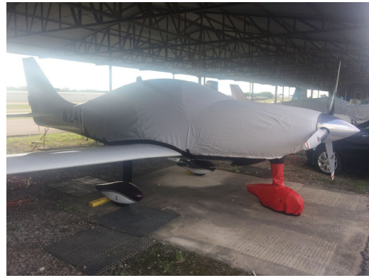
Lancair Columbia Extended Canopy/Engine Cover, Nose Wheelpant Cover