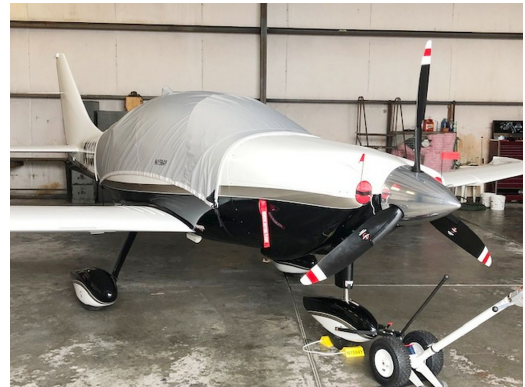
Columbia 350 Travel Cover, Engine Plugs