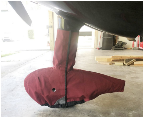
Cessna Corvalis, Lancair Columbia Wheelpant & Strut Cover