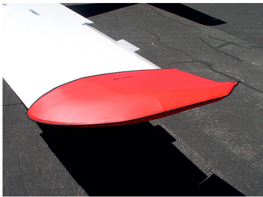
Cessna 350/400 Wingtip Pads