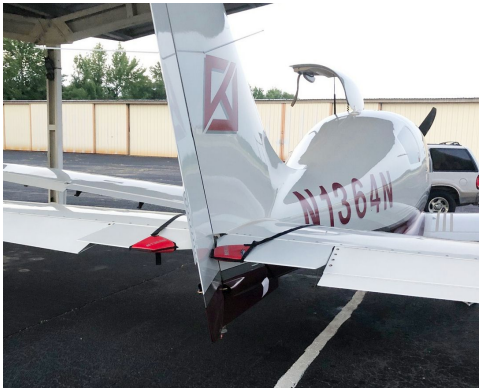
Lancair Columbia Rudder Gust Pad