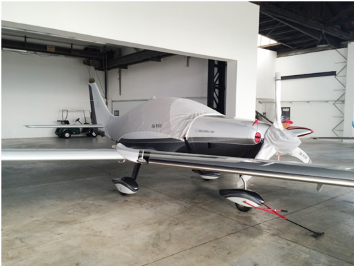
Cessna 350/400 Canopy Cover, extended to tail, Prop Cover, Plugs