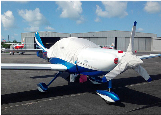
Lancair Insulated Engine Covers, fully and partially enclosed, 3D models