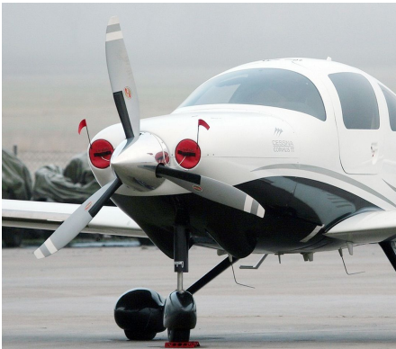
Cessna Corvalis, Corvalis TT, Models T240, 350 & 400 Engine Inlet Plugs, 400/Ttx Models

Engine Inlet Plugs are custom fit for your Lancair Columbia 300, 350, 400 intakes, made with heavy-duty vinyl material, and stuffed with a single block of sculpted urethane foam. Each plug has a zipper that allows the foam to be removed and dried if necessary. Engine plugs have warning flags that are visible from the cockpit or 'remove before flight' streamers sewn onto the face of the plugs. Most plugs are imprinted with the aircraft registration number in black for an extra charge. Storage bag NOT included. Engine plugs may be inserted after flight when the engine is still warm. Engine Inlet Plugs are commonly referred to as Cowl Plugs, Intake Plugs, Cowl Blocks, Engine Blocks, and Engine Bungs . Designed to prevent damage to the aircraft extremities in crowded hangars, these products are made of bright red Naugahyde and thickly padded with a sandwich of closed cell foam.