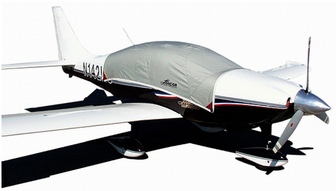
Cessna 350/400 Canopy Cover

This cover type is made from Silver Acrylic Sunbrella canvas and is 100% lined with a soft and smooth microfiber. Bruce's Custom Covers developed this material combination especially for aircraft protection. The outer material is medium weight and treated for water resistance, UV resistance and anti-static buildup. The inner lining is a very soft and smooth microfiber to prevent scratching. The material is very reflective, and tests show that the cabin interior temperature can be reduced to near-ambient temperature on the hottest of days. It is water, ice and snow repellent, yet breathable to allow moisture to escape from between the cover and the aircraft surface.