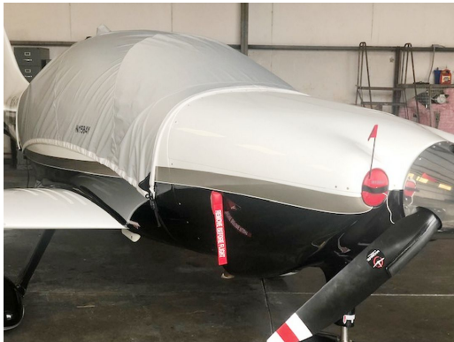
Columbia 350 Travel Cover, Engine Plugs

Travel Covers are made with Silver Solution-Dyed Polyester fabric and only lined over the windshield to save weight. The material is lightweight and more compact for easy stowage in the aircraft. The polyester material is water resistant, but only intended for occasional use outside. We also have an ultra lightweight material available for fitted hangar dust covers. For daily outdoor use, the non-travel Sunbrella Cover is the best choice.