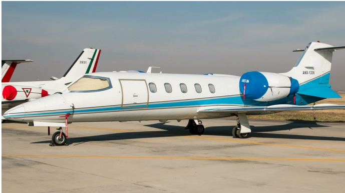
Lear 35 Engine & Pitot Covers