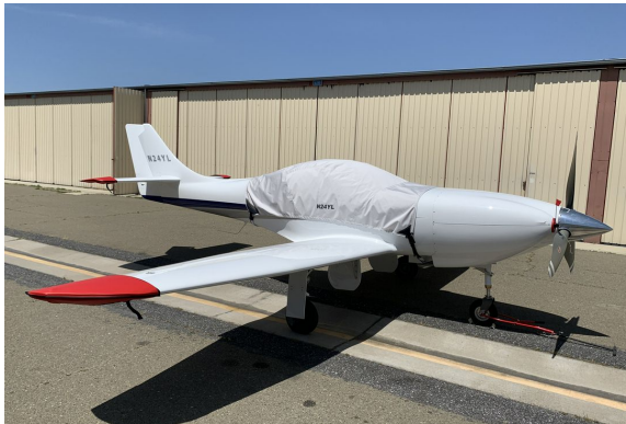
Lancair Legacy 2000 Wingtip & Horiz. Stab. Pads

This cover type is made from Silver Acrylic Sunbrella canvas and is 100% lined with a soft and smooth microfiber. Bruce's Custom Covers developed this material combination especially for aircraft protection. The outer material is medium weight and treated for water resistance, UV resistance and anti-static buildup. The inner lining is a very soft and smooth microfiber to prevent scratching. The material is very reflective, and tests show that the cabin interior temperature can be reduced to near-ambient temperature on the hottest of days. It is water, ice and snow repellent, yet breathable to allow moisture to escape from between the cover and the aircraft surface.