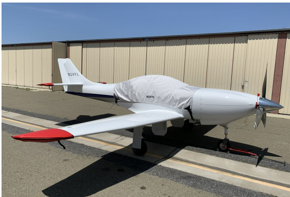
Lancair Legacy 2000 Wingtip & Horiz. Stab. Pads