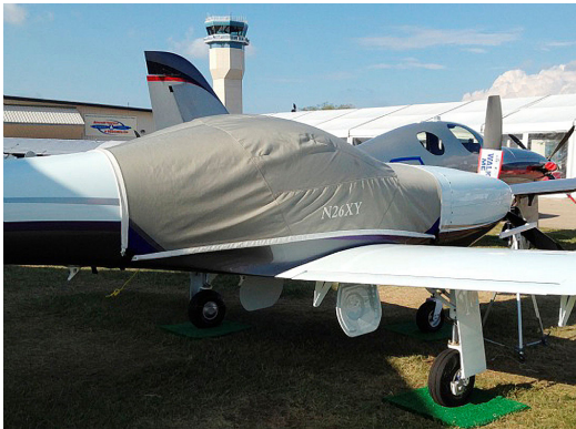
Lancair Legacy Canopy Cover