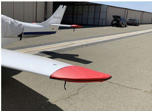
Lancair Legacy 2000 Wingtip & Horiz. Stab. Pads

Designed to prevent damage to the aircraft extremities in crowded hangars, these products are made of bright red Naugahyde and thickly padded with a sandwich of closed cell foam.