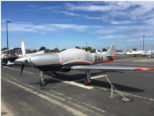
Lancair Legacy 2000 Travel Canopy Cover

non-travel Sunbrella Cover is the best choice.