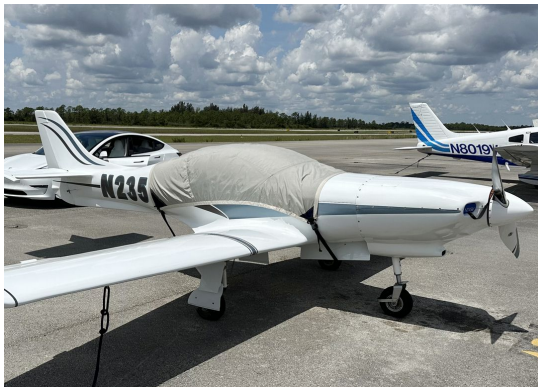
Lancair 235 Canopy Cover

Travel Covers are made with Silver Solution-Dyed Polyester fabric and only lined over the windshield to save weight. The material is lightweight and more compact for easy stowage in the aircraft. The polyester material is water resistant, but only intended for occasional use outside. We also have an ultra lightweight material available for fitted hangar dust covers. For daily outdoor use, the non-travel Sunbrella Cover is the best choice.