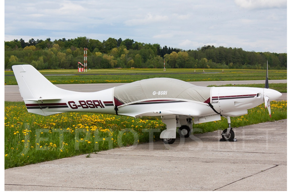
Lancair 235 Canopy Cover