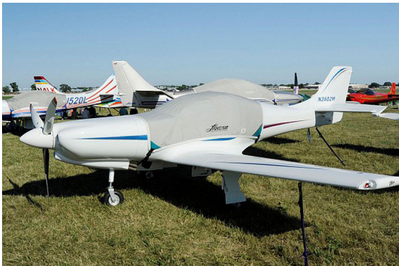
Lancair 360 MkII Canopy Cover

Travel Covers are made with Silver Solution-Dyed Polyester fabric and only lined over the windshield to save weight. The material is lightweight and more compact for easy stowage in the aircraft. The polyester material is water resistant, but only intended for occasional use outside. We also have an ultra lightweight material available for fitted hangar dust covers. For daily outdoor use, the non-travel Sunbrella Cover is the best choice.