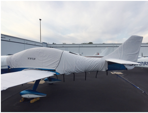
Lancair ES Wing Covers & Empennage Cover (sold separately)