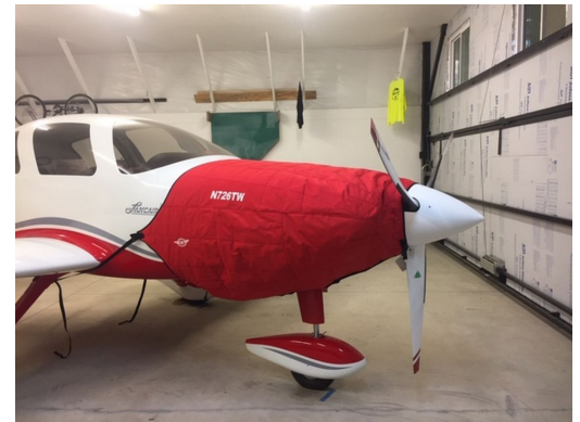
Lancair ES Insulated Engine Cover, Fully Enclosed