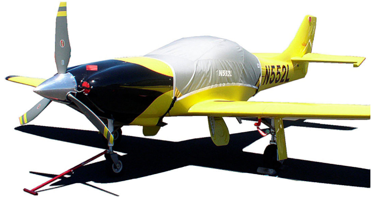
Canopy Cover for Lancair Legacy