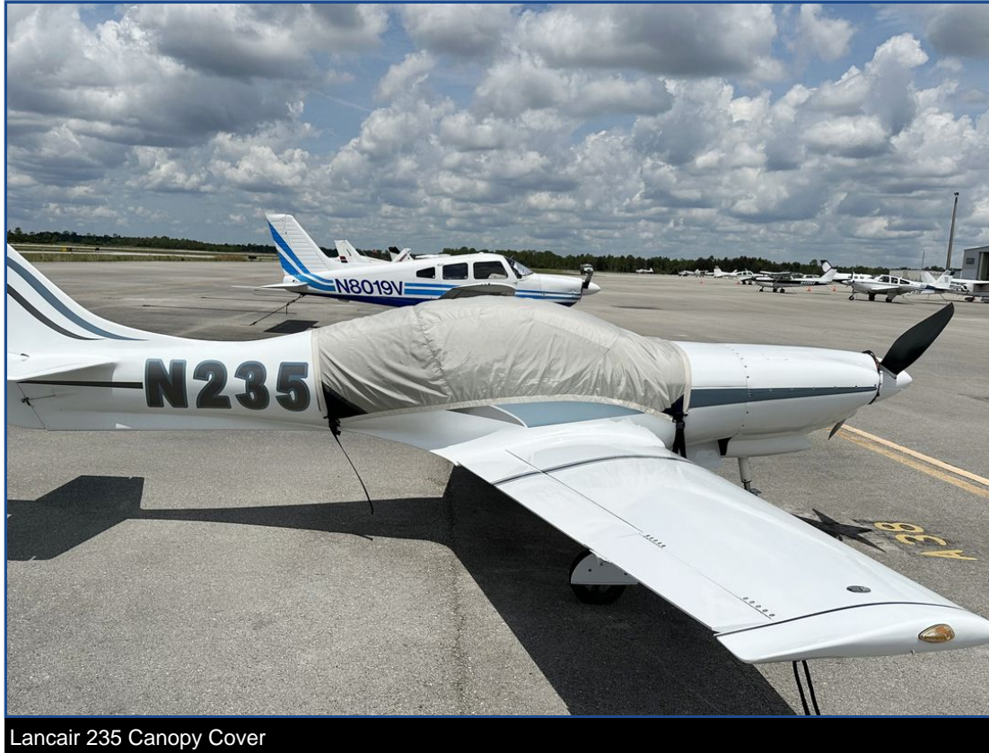
Lancair 235 Canopy Cover