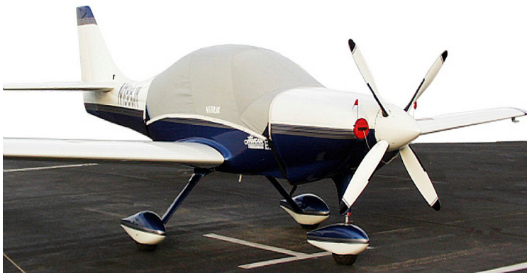
Lancair ES Canopy Cover

This cover type is made from Silver Acrylic Sunbrella canvas and is 100% lined with a soft and smooth microfiber. Bruce's Custom Covers developed this material combination especially for aircraft protection. The outer material is medium weight and treated for water resistance, UV resistance and anti-static buildup. The inner lining is a very soft and smooth microfiber to prevent scratching. The material is very reflective, and tests show that the cabin interior temperature can be reduced to near-ambient temperature on the hottest of days. It is water, ice and snow repellent, yet breathable to allow moisture to escape from between the cover and the aircraft surface.