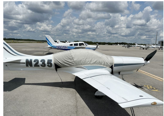
Lancair 235 Canopy Cover