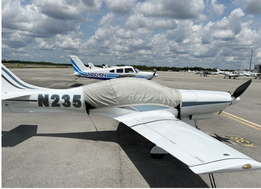
Lancair 235 Canopy Cover

This cover type is made from Silver Acrylic Sunbrella canvas and is 100% lined with a soft and smooth microfiber. Bruce's Custom Covers developed this material combination especially for aircraft protection. The outer material is medium weight and treated for water resistance, UV resistance and anti-static buildup. The inner lining is a very soft and smooth microfiber to prevent scratching. The material is very reflective, and tests show that the cabin interior temperature can be reduced to near-ambient temperature on the hottest of days. It is water, ice and snow repellent, yet breathable to allow moisture to escape from between the cover and the aircraft surface.