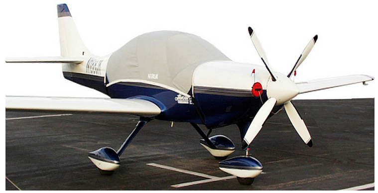
Lancair ES Canopy Cover