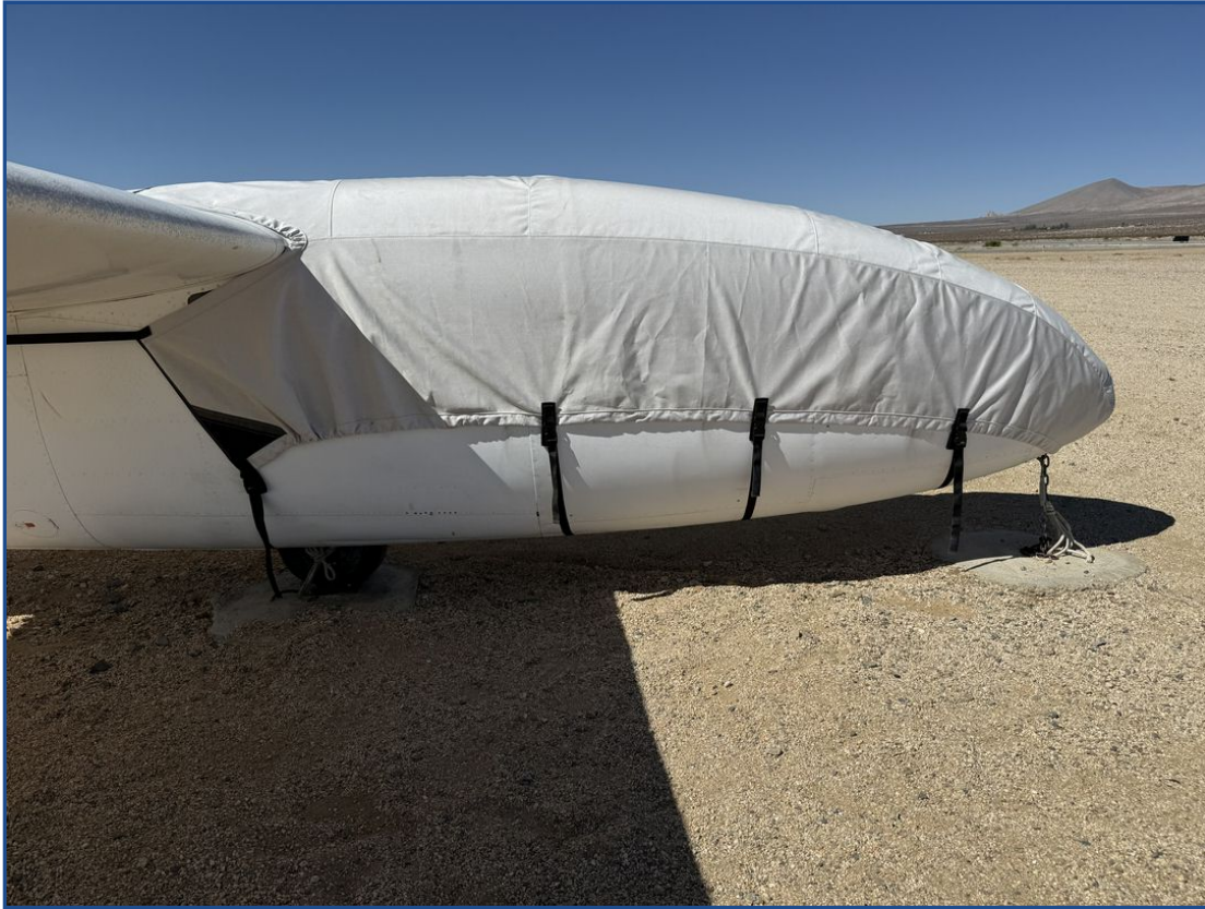
Blanik L-23 Canopy/Nose Cover