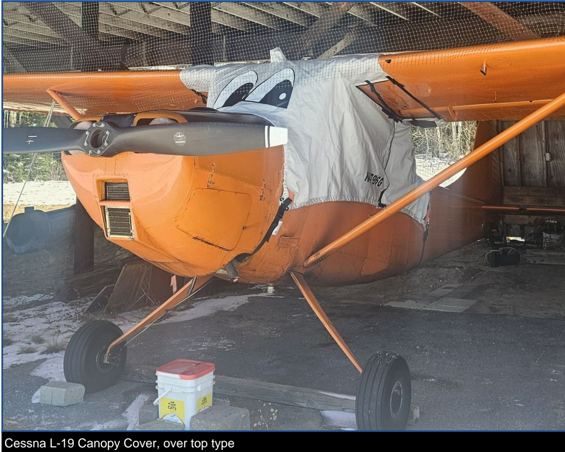
Cessna L-19 Canopy Cover, over top type