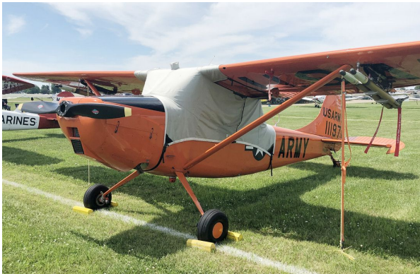
Cessna L-19 Bird Dog Canopy Cover