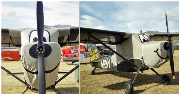
Cessna L-19 Bird Dog Canopy Cover, Engine Cover

This cover type is made from Silver Acrylic Sunbrella canvas and is 100% lined with a soft and smooth microfiber. Bruce's Custom Covers developed this material combination especially for aircraft protection. The outer material is medium weight and treated for water resistance, UV resistance and anti-static buildup. The inner lining is a very soft and smooth microfiber to prevent scratching. The material is very reflective, and tests show that the cabin interior temperature can be reduced to near-ambient temperature on the hottest of days. It is water, ice and snow repellent, yet breathable to allow moisture to escape from between the cover and the aircraft surface.