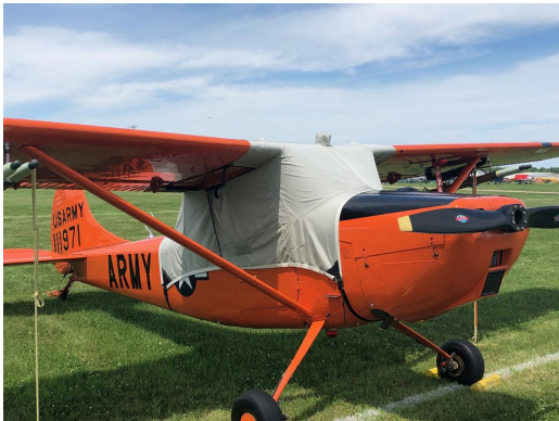
Cessna L-19 Bird Dog Over-Top Canopy Cover

This cover type is made from Silver Acrylic Sunbrella canvas and is 100% lined with a soft and smooth microfiber. Bruce's Custom Covers developed this material combination especially for aircraft protection. The outer material is medium weight and treated for water resistance, UV resistance and anti-static buildup. The inner lining is a very soft and smooth microfiber to prevent scratching. The material is very reflective, and tests show that the cabin interior temperature can be reduced to near-ambient temperature on the hottest of days. It is water, ice and snow repellent, yet breathable to allow moisture to escape from between the cover and the aircraft surface.