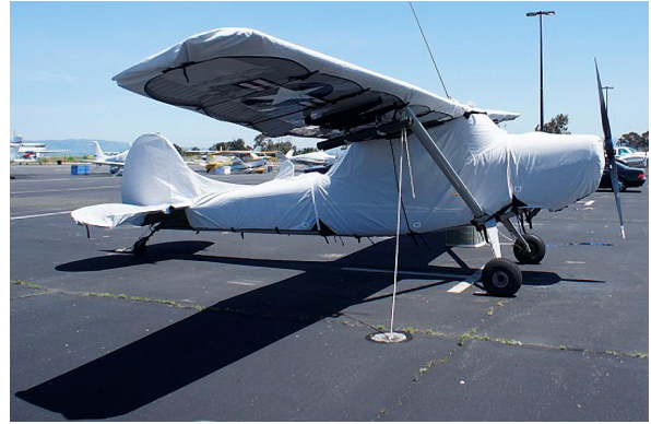
Wing Covers on Cessna Bird Dog