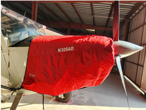
Cessna Bird Dog, L-19 Insulated Engine Cover

This cover type is made from Silver Acrylic Sunbrella canvas and is 100% lined with a soft and smooth microfiber. Bruce's Custom Covers developed this material combination especially for aircraft protection. The outer material is medium weight and treated for water resistance, UV resistance and anti-static buildup. The inner lining is a very soft and smooth microfiber to prevent scratching. The material is very reflective, and tests show that the cabin interior temperature can be reduced to near-ambient temperature on the hottest of days. It is water, ice and snow repellent, yet breathable to allow moisture to escape from between the cover and the aircraft surface.