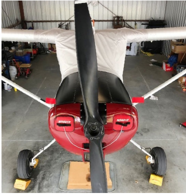
Cessna Bird Dog, L-19, O-1, 305 Engine Inlet Plugs

This cover type is made from Silver Acrylic Sunbrella canvas and is 100% lined with a soft and smooth microfiber. Bruce's Custom Covers developed this material combination especially for aircraft protection. The outer material is medium weight and treated for water resistance, UV resistance and anti-static buildup. The inner lining is a very soft and smooth microfiber to prevent scratching. The material is very reflective, and tests show that the cabin interior temperature can be reduced to near-ambient temperature on the hottest of days. It is water, ice and snow repellent, yet breathable to allow moisture to escape from between the cover and the aircraft surface.