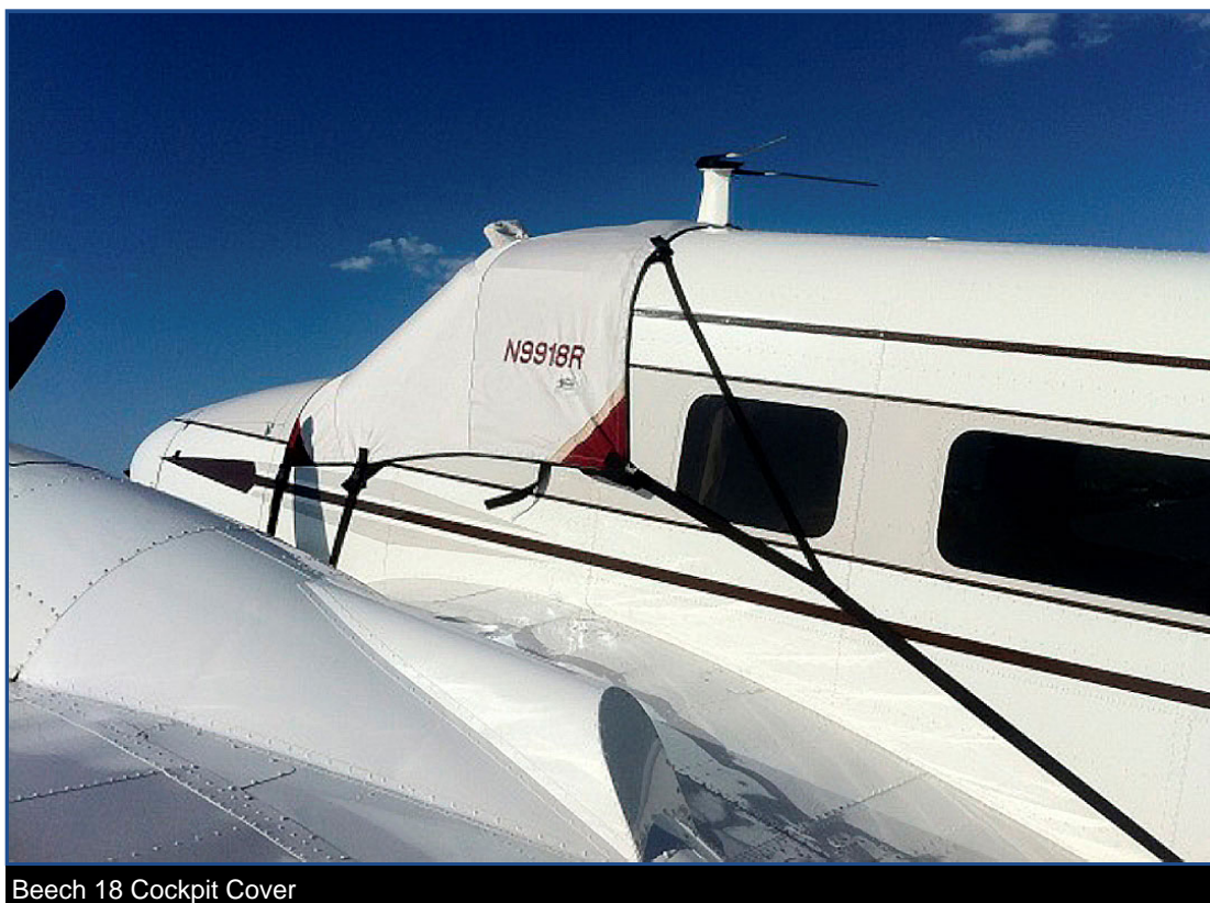
Beech 18 Cockpit Cover