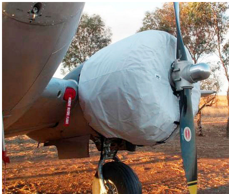
Beech D-18 Engine Covers, Center Section Oil Cooler Inlet Plugs, and Pitot Covers

This cover type is made from Silver Acrylic Sunbrella canvas and is 100% lined with a soft and smooth microfiber. Bruce's Custom Covers developed this material combination especially for aircraft protection. The outer material is medium weight and treated for water resistance, UV resistance and anti-static buildup. The inner lining is a very soft and smooth microfiber to prevent scratching. The material is very reflective, and tests show that the cabin interior temperature can be reduced to near-ambient temperature on the hottest of days. It is water, ice and snow repellent, yet breathable to allow moisture to escape from between the cover and the aircraft surface.