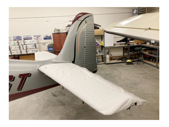
Navion Rangemaster Horizontal Stabilizer Covers

WINTER USE MATERIAL - Made with Solution-Dyed Polyester fabric, this option is intended for seasonal use to aid in deicing, rain mitigation, or for occasional travel. The material is lighter and more compact, but more susceptible to UV damage and may have a shorter useful life if used continuously outside than the all-year use material.