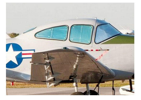
Navion L-17 Heatshield Set

Windshield Heatshields are interior sunshades for an aircraft's front windshield. The product is a unique composite of closed-cell foam with a silver mylar finish. The semi-rigid design is stiff enough to stand along the inside of the windshield using sun visors or window framing. It folds up flat and easily stores in the included storage sleeve. Some designs may require velcro and suction cups or split right and left sides. A Heatshield is an excellent short-term remedy for cockpit overheating. An external fabric cover is far more effective and practical for long-term protection.