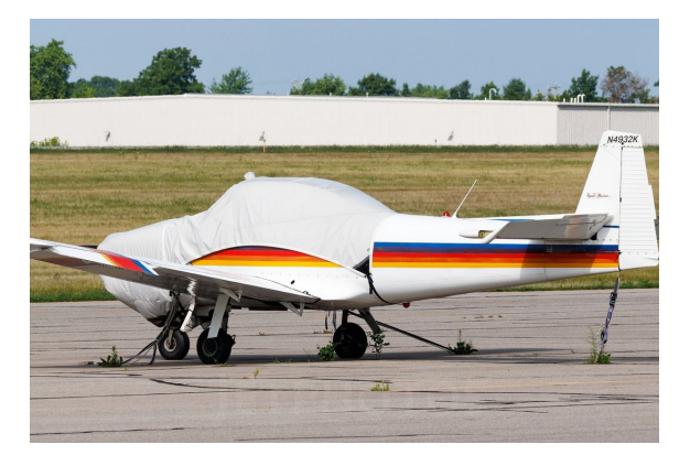
Navion Canopy Cover, Engine Cover (fully enclosed)

This cover type is made from Silver Acrylic Sunbrella canvas and is 100% lined with a soft and smooth microfiber. Bruce's Custom Covers developed this material combination especially for aircraft protection. The outer material is medium weight and treated for water resistance, UV resistance and anti-static buildup. The inner lining is a very soft and smooth microfiber to prevent scratching. The material is very reflective, and tests show that the cabin interior temperature can be reduced to near-ambient temperature on the hottest of days. It is water, ice and snow repellent, yet breathable to allow moisture to escape from between the cover and the aircraft surface.