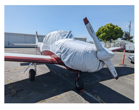
Navion Canopy/Engine Cover, Prop Cover