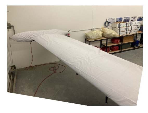
Navion Rangemaster Wing Covers