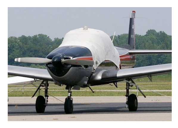
Navion Canopy Cover with forward bay extension