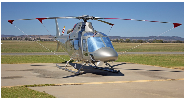
Agusta 119 Cockpit/Cabin HeatShields

Cabin Heatshields are interior sunshades for the aircraft's passenger cabin area. The product is a unique composite of closed-cell foam with a silver mylar finish. The semi-rigid design is stiff enough to stand inside the window framing. The set folds up flat and is easily stored in the included storage sleeve. Some designs may require velcro and suction cups. A Heatshield is an excellent short-term remedy for cockpit overheating, but an external fabric cover is more effective for long-term protection.