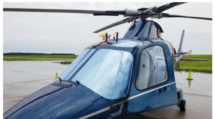
Agusta AW109S/SP Grand Heatshield Set