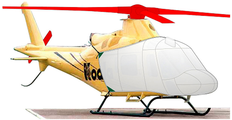
Agusta Leonardo A169 Bubble Cover with Wire Strike, 3D model Koala Bubble, Rotor Hub, Blade & Tail Rotor Covers (illustration)