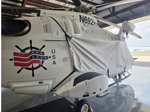
Agusta AW169 Bubble Cover

Travel Covers are made with Silver Solution-Dyed Polyester fabric and fully lined over the entire cover. The material is lightweight and more compact for easy storage in the aircraft. The polyester material is water resistant, but only intended for occasional use outside. We also have an ultra lightweight material available for fitted hangar dust covers. For daily outdoor use, the non-travel Sunbrella Cover is the best choice.