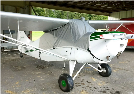
Aeronca Champ Light Weight Travel Canopy Cover, Over-Top Style