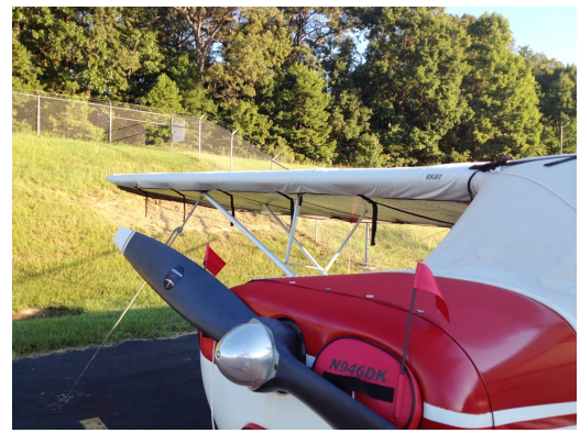
Aeronca Champ Engine Plugs, Wing Covers