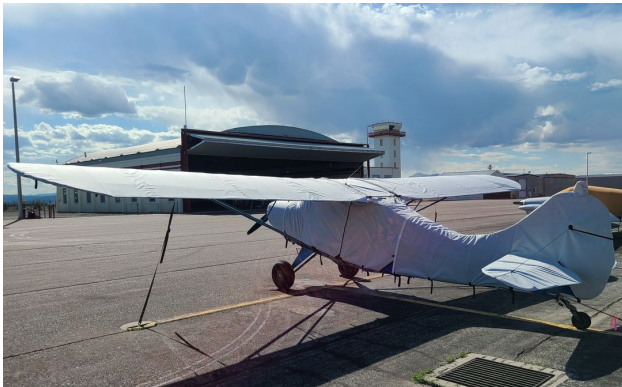
Champion 7EC Complete Cover Set

WINTER USE MATERIAL - Made with Solution-Dyed Polyester fabric, this option is intended for seasonal use to aid in deicing, rain mitigation, or for occasional travel. The material is lighter and more compact, but more susceptible to UV damage and may have a shorter useful life if used continuously outside than the all-year use material.