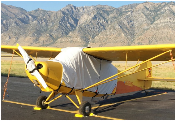
Aeronca Champ 7AC, 7EC Extended Canopy Cover (Over-The-Top Style)