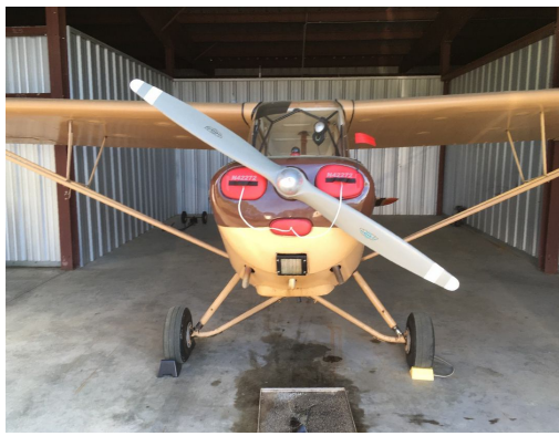
Aeronca Champ Engine Plugs, set of 3