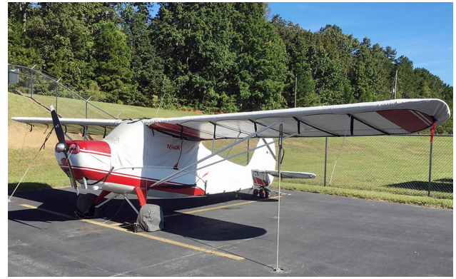
Aeronca Champ 7AC/7EC Wing and Canopy Cover (Over-The-Top Style)