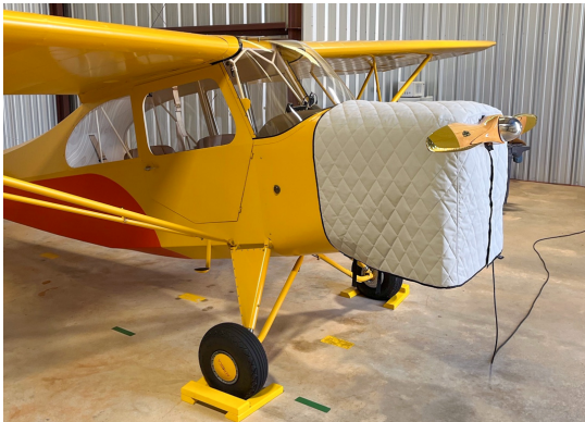
Aeronca 7AC Insulated Hangar Blanket, interior use