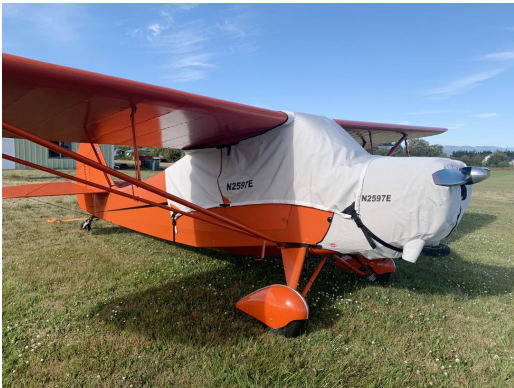
Aeronca 7AC Champ Over-Top Canopy Cover & Engine Cover

This cover type is made from Silver Acrylic Sunbrella canvas and is 100% lined with a soft and smooth microfiber. Bruce's Custom Covers developed this material combination especially for aircraft protection. The outer material is medium weight and treated for water resistance, UV resistance and anti-static buildup. The inner lining is a very soft and smooth microfiber to prevent scratching. The material is very reflective, and tests show that the cabin interior temperature can be reduced to near-ambient temperature on the hottest of days. It is water, ice and snow repellent, yet breathable to allow moisture to escape from between the cover and the aircraft surface.