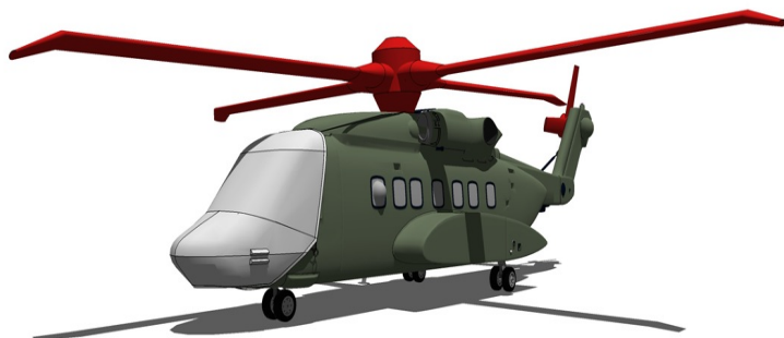
Sikorsky S-92 Windshield/Nose, Blade, Rotor Hub &amp; Tail Rotor Covers

This cover type is made from Silver Acrylic Sunbrella canvas and is 100% lined with a soft and smooth microfiber. Bruce's Custom Covers developed this material combination especially for aircraft protection. The outer material is medium weight and treated for water resistance, UV resistance and anti-static buildup. The inner lining is a very soft and smooth microfiber to prevent scratching. The material is very reflective, and tests show that the cabin interior temperature can be reduced to near-ambient temperature on the hottest of days. It is water, ice and snow repellent, yet breathable to allow moisture to escape from between the cover and the aircraft surface.