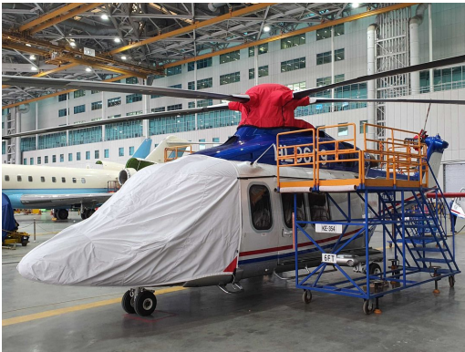
Agusta AW139 Cockpit/Nose, Rotor Mast Cover

WINTER USE MATERIAL - Made with Solution-Dyed Polyester fabric, this option is intended for seasonal use to aid in deicing, rain mitigation, or for occasional travel. The material is lighter and more compact, but more susceptible to UV damage and may have a shorter useful life if used continuously outside than the all-year use material.