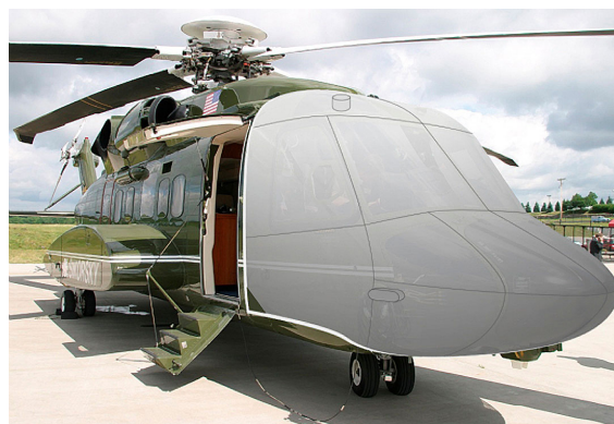
Sikorsky S-92 Windshield/Nose Cover (illustration)