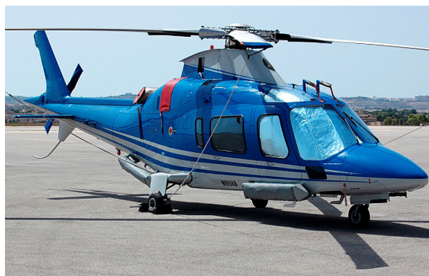
Covers, Plugs, HeatShields and related items for the Agusta MH-68A