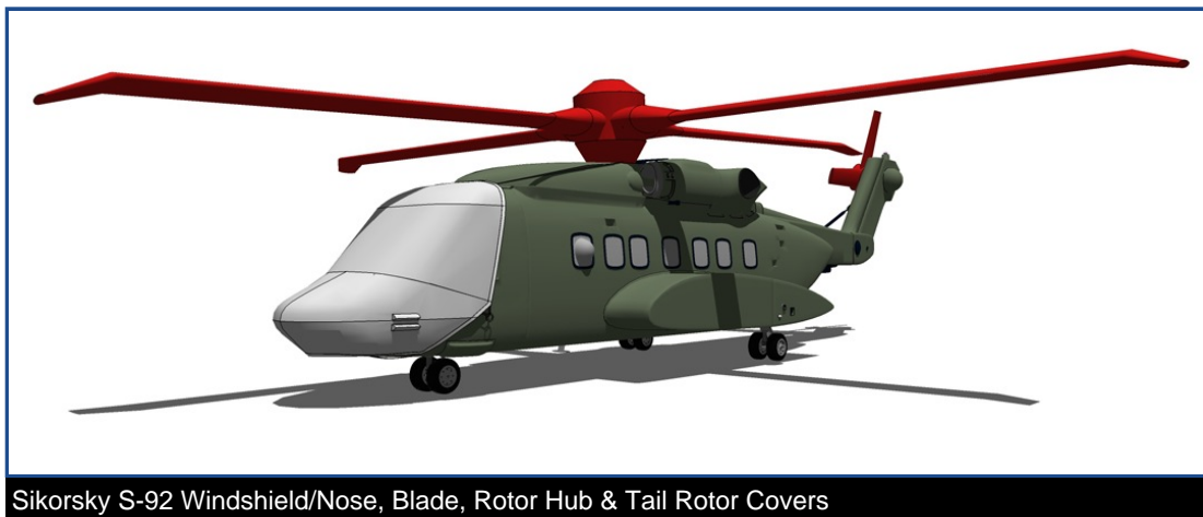
Sikorsky S-92 Windshield/Nose, Blade, Rotor Hub &amp; Tail Rotor Covers