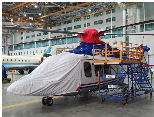
Agusta AW139 Cockpit/Nose, Rotor Mast Cover

This cover type is made from Silver Acrylic Sunbrella canvas and is 100% lined with a soft and smooth microfiber. Bruce's Custom Covers developed this material combination especially for aircraft protection. The outer material is medium weight and treated for water resistance, UV resistance and anti-static buildup. The inner lining is a very soft and smooth microfiber to prevent scratching. The material is very reflective, and tests show that the cabin interior temperature can be reduced to near-ambient temperature on the hottest of days. It is water, ice and snow repellent, yet breathable to allow moisture to escape from between the cover and the aircraft surface.