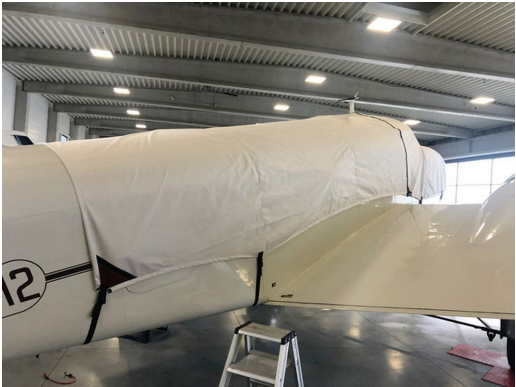
Lockheed 12 Canopy/Nose Cover

This cover type is made from Silver Acrylic Sunbrella canvas and is 100% lined with a soft and smooth microfiber. Bruce's Custom Covers developed this material combination especially for aircraft protection. The outer material is medium weight and treated for water resistance, UV resistance and anti-static buildup. The inner lining is a very soft and smooth microfiber to prevent scratching. The material is very reflective, and tests show that the cabin interior temperature can be reduced to near-ambient temperature on the hottest of days. It is water, ice and snow repellent, yet breathable to allow moisture to escape from between the cover and the aircraft surface.